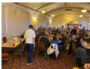
Race Night in full swing!

We finally got to enjoy our first full fundraising event since before the pandemic with a return of the popular Race Night in May. Thank you to everyone who supported this event in any way and we are particularly grateful to the Rufford Pub who stepped in to be our venue at the last minute. We are delighted that as a result of this, the pub is looking to work with us as their Charity partner in the coming months.