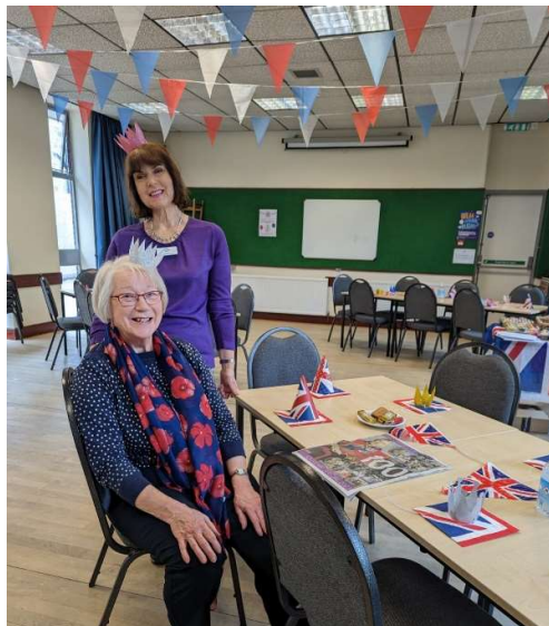
Two of our super volunteers prepping for our Coronation Party

We regularly get interesting and helpful speakers to talk to the group. These talks can be on topics relating to health and wellbeing or just topics that are interesting and entertaining in themselves. I choose our speakers based on feedback from members.