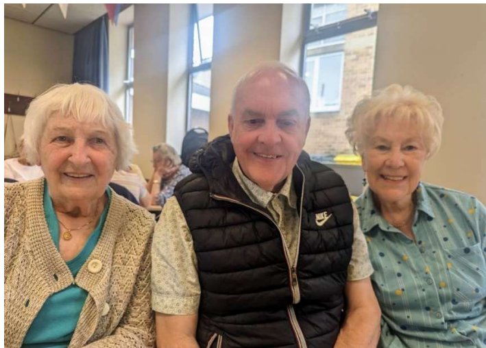
Some of our wonderful members from the Friday Moving On Friendship Group

We are delighted to have brought in some new volunteers to help at our new group and make attendees feel at ease. We have had some lovely feedback with members saying the new group is "so friendly and welcoming" and another saying it has "changed my life for the better".