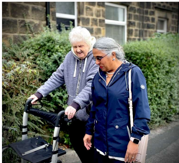
One of our new members and volunteers as they walk to the Thursday Moving On Friendship Group

We are delighted to have brought in some new volunteers to help at our new group and make attendees feel at ease. We have had some lovely feedback with members saying the new group is "so friendly and welcoming" and another saying it has "changed my life for the better."