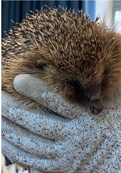
Rhubarb, a rescue hedgehog, saying hello to the group

We have also been given an insight into using modern technology to study local birds and their songs and got to see a hedgehog up close with a Hedgehog Rescue Centre.