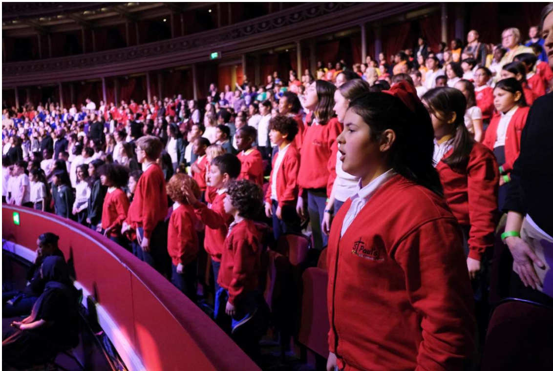
Camden Schools' Music Festival, April 2023 at the Royal Albert Hall