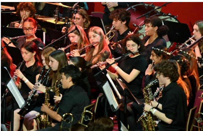
Camden Youth Orchestra performing at the Camden Schools' Music Festival, April 2025

Camden Music Trust funding contributes to a wide range of initiatives, including holiday courses, after-school activities and the borough's two Saturday Music Centres which offer 41 musical groups ranging from Little Jammers early years music-making to Camden Youth Orchestra for secondary aged players of Grade 4+ level.