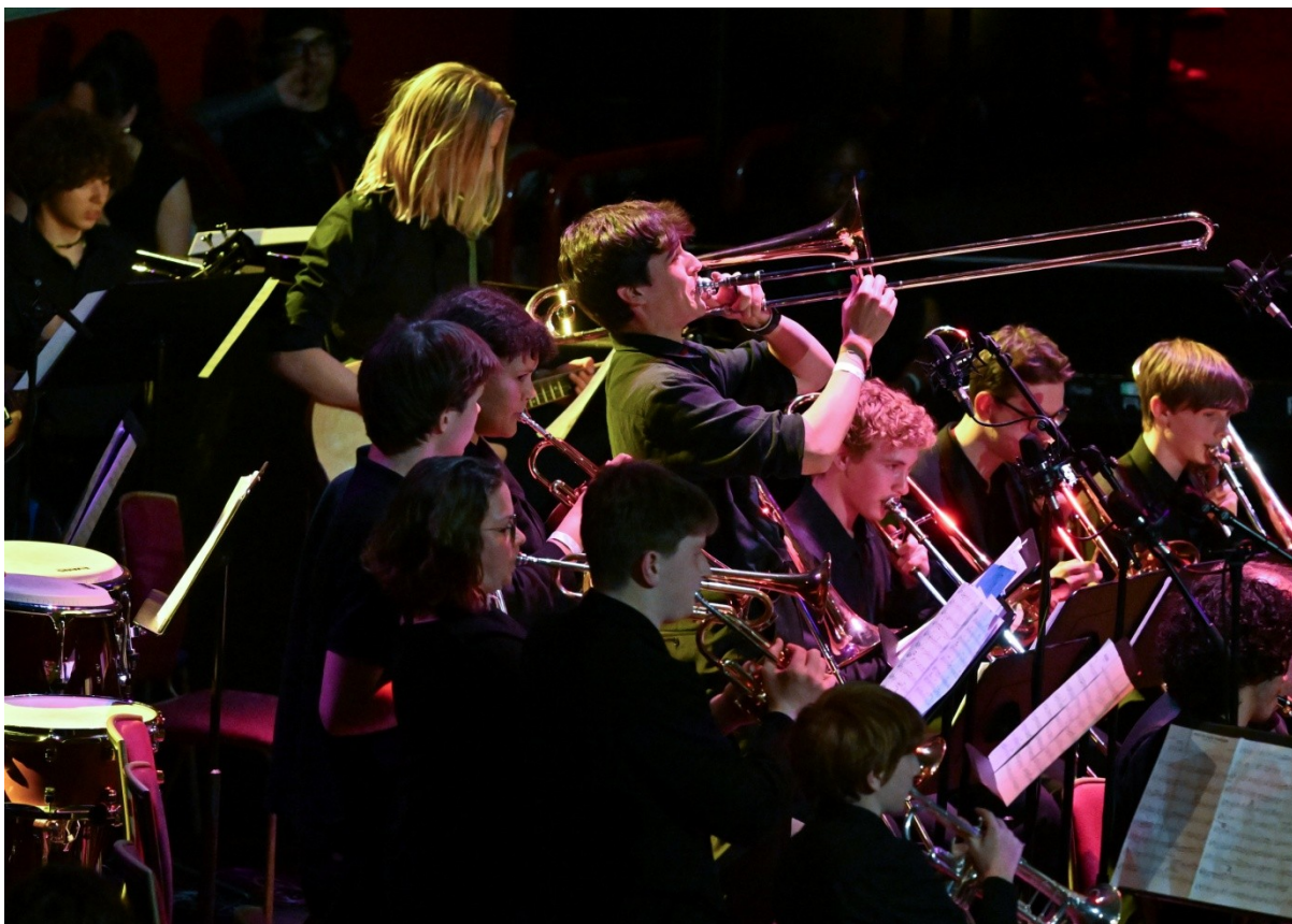
Camden Youth Orchestra

At the festival, the band performed Moanin' (Charles Mingus) and Mueva las Huevas (Gordon Goodwin) to an enthusiastic audience and received glowing feedback from Music for Youth mentors. The mentors praised the band's "great feel both driving and swinging", and highlighted the "flamboyant solos" and "tight ensemble playing". One mentor commented, "The saxophone solo was stylistically very fitting for this bluesy feel, and the trumpet contrasted well by placing notes above with a clearer tone."