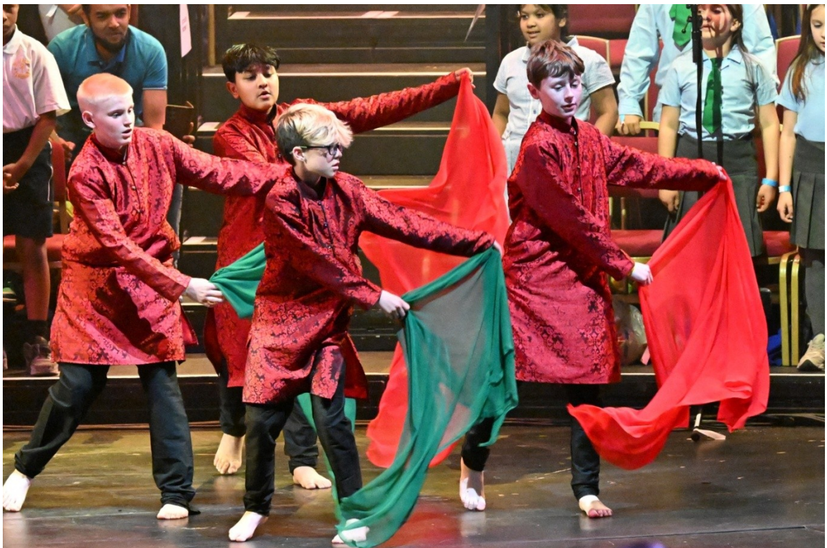
The Khiyo Project, with dancing and singing by Camden schoolchildren at the Royal Albert Hall, celebrated the significant Bengali community in our multi-cultural borough