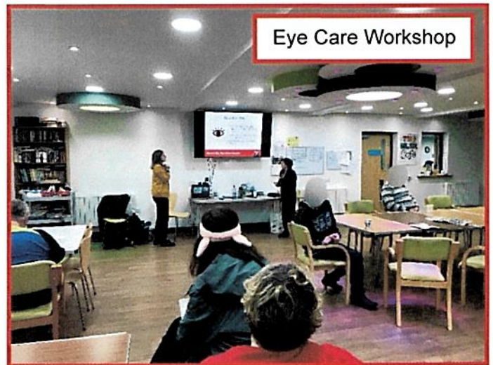
Eye Care Workshop