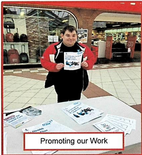
Promoting our Work