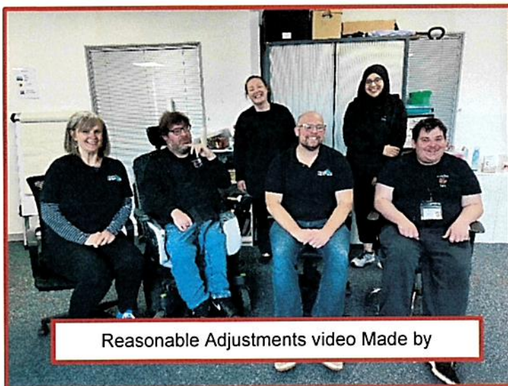
Reasonable Adjustments video Made by