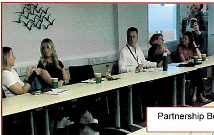
Partnership Board Meeting