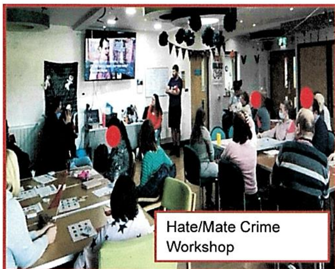
Hate/Mate Crime Workshop