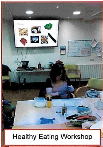
Healthy Eating Workshop