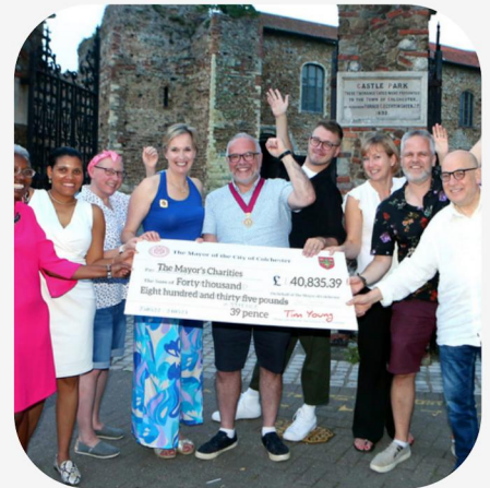
Mayor's charities final celebration, receiving the cheque.

Grants of £1,500 from LandAid towards employing our supported housing manager and £3,000 from The Tudwick Foundation to continue Nightstop for 3 months after our Nationwide Community grant was spent.