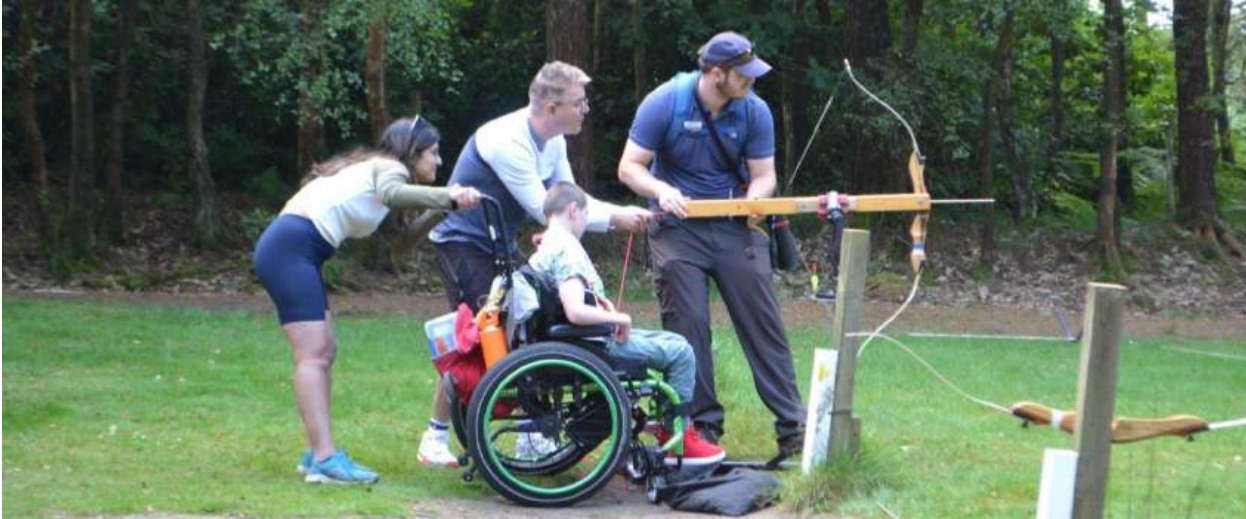
An athlete uses the red rope to position the bow and arrow, a few minutes after this shot the team celebrated as he got his first bullseye

This year we supported a growing number of younger and higher-need children, including more nonverbal athletes. To ensure every child received the support they needed, we increased our volunteer coach team from 20 to 21, enabling more 2:1 support where required. With the sun shining all three of our groups took on a combination of team building activities (crate building and pioneering) and individual challenges (zip lining, archery, climbing).