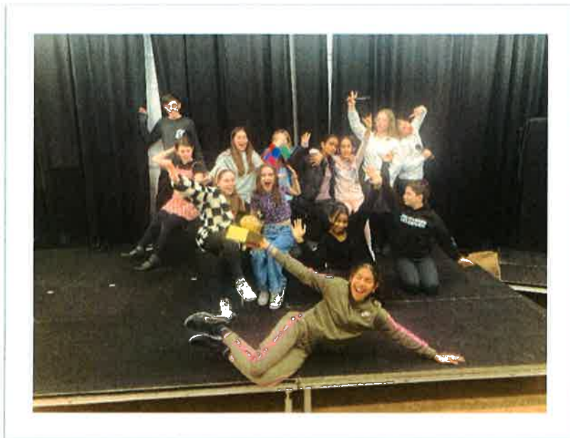
Our production of 'Fame'

At Pollyanna one of the biggest things, we foster is Confidence - It's no secret that children and young people are impressionable. They learn what they observe and what they are taught. As they grow up, they form opinions and beliefs about themselves and their place in the world. This is why it's so important to create a positive self-image for them from an early age. Children who have confidence and self-esteem develop a strong foundation for their future. They are more resilient and happier, which makes them better able to handle difficult situations. Performance arts can help children explore their creativity and develop new skills for life.