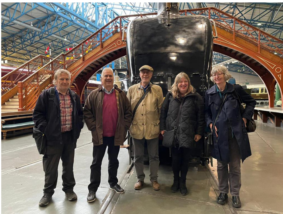
A visit to the National Rail Museum in York