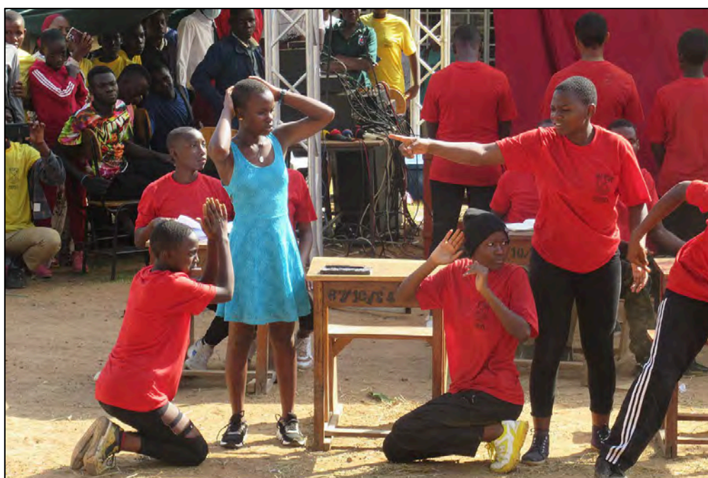
Music, Drama and Dance competitions in school