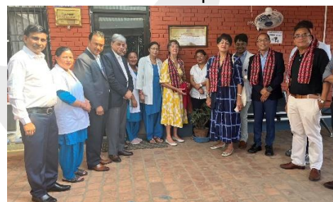
From Left: Oxygen plant to Damak, Anaesthetic equipment to NAMS, Patient waiting room