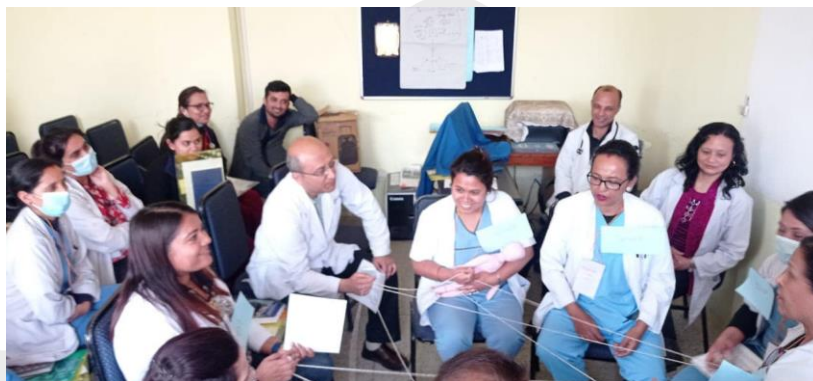
From Top Left: Child protection training programme at TU Teaching Hospital, Basic Life support training to police officers in Nepal

In collaboration with So The Child May Live and the Nepal Paediatric Society, we continued our Child Protection training program across various institutes in Nepal. Additionally, we supported the Nepal Life Support Foundation in conducting Basic Life Support training sessions for diverse groups, including police officers, school staff, members of parliament, and social workers.