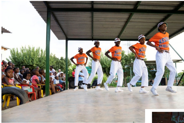
Showtime for Sigiya Sonke!