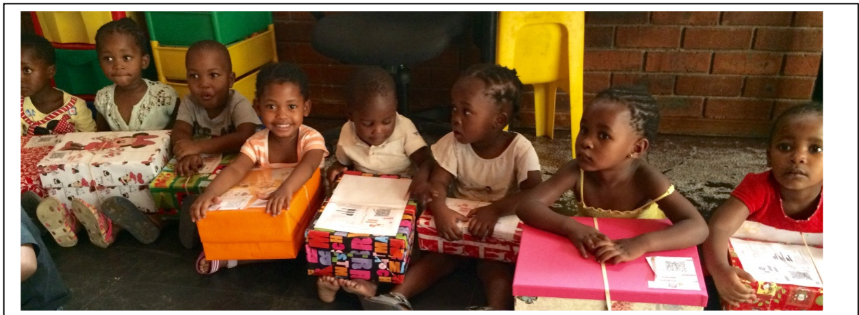
Christmas gift time at Leratong

Nevertheless every one of the projects we support reopened its doors and gave the best service possible under circumstances where more people were even more in need, whilst at the same time donations and resources were in even shorter supply. Given the high incidence of HIV/AIDS in the population many people have to be extra careful when mixing with others so some of the interaction, so important especially to children, had to be carefully handled. But, as the following photos show, our resilient and energetic project teams still managed to offer so much of value to a population in crisis and deserve our huge respect, appreciation and continued support.