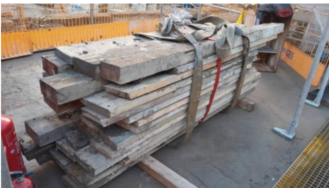
Plywood donated to Deen and Wellgate