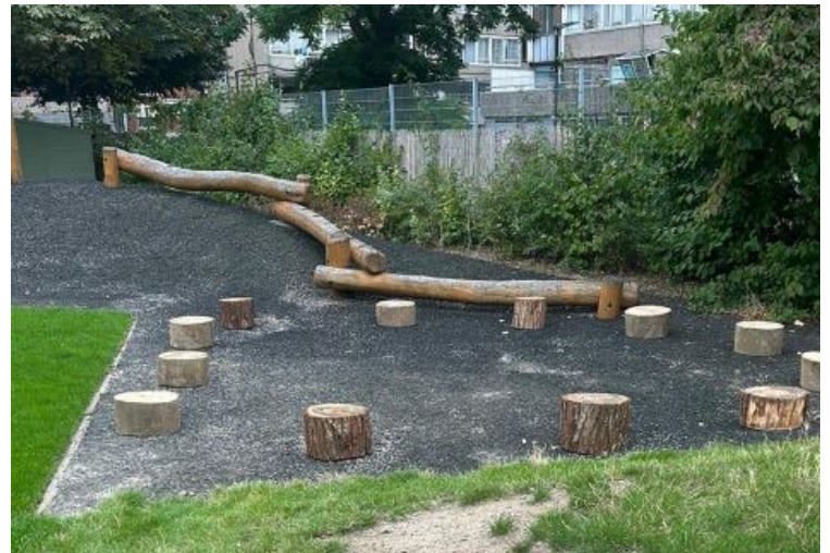
Tree Logs added to play space at Walworth Gardens