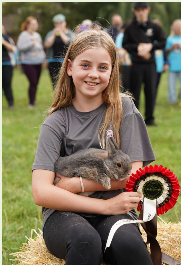
Wellgate Young Farmer with Bunny "Flip"

Cooperative Bank 1 Balloon Street Manchester M60 4EP