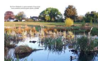
Left Firs Farm Wetland

The Forum has played an active part at each stage, responding to consultations, preparing Hearing Statements in response to the Inspector's questions and attending the hearings in public. There is more to come and we await the Inspector's final judgements and his