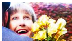
My Perfect Valentine

EBOFF has had a great year making 5 films (2 short comedies and 3 longer dramas). We fund ourselves by organising occasional film and quiz events. Our films are fun to make and often have some kind of social meaning – so this year we made one about loneliness, one about a missing woman and one about the consequences of searching out old flames. The latter film ( The Last Date ) won a 4 star award and was shown at the British International Amateur Film Festival in Birmingham. We were competing with international films often made by aspiring film directors and actors. So pretty good for an amateur group with little experience and no funding!! We are looking forward to next year and are planning a ghost film, films about hoarding, dementia and work problems. We welcome new aspiring actors or actresses as well as those who like to come in as extras.