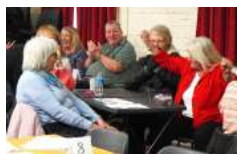
Quiz runners up