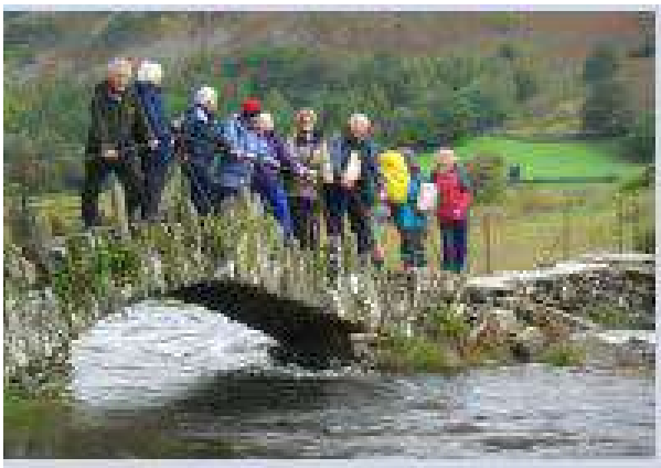
The Walkabouts Rambling Group

The Forum thanks our affiliates for their continuing support throughout the year. In return the Forum promotes their activities and programmes in our newsletters, eNews and website. Affiliates can also insert their leaflets in our mail-outs for a nominal cost.