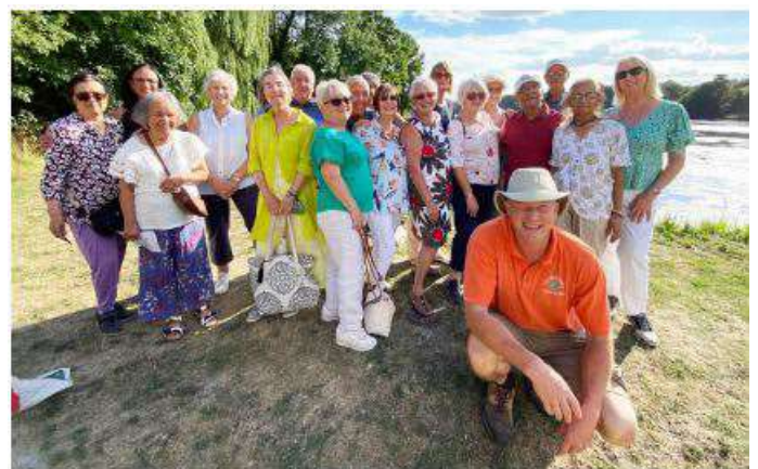
Forum members socialising together