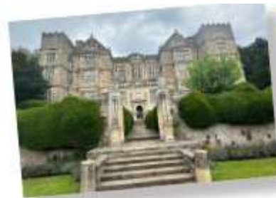
Fountains Hall visit