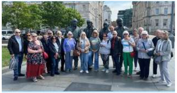
Liverpool city break

(XX) = Initials of the Social Committee member listed in the inside cover of this report