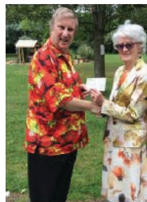
A Forum Bingo session and one of the monthly lottery winners