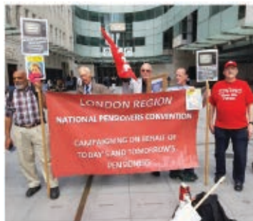
Campaigning with the National Pensioners Convention

These events are not arranged specifically to fund raise for the Forum but we try to add a small donation as "every little helps" as they say. We raised £618 from these events.