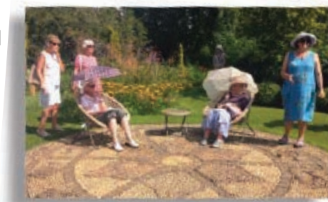
Theobalds Farmhouse Gardens

These events are not arranged specifically to fund raise for the Forum but we try to add a small donation as "every little helps" as they say. We raised £618 from these events.