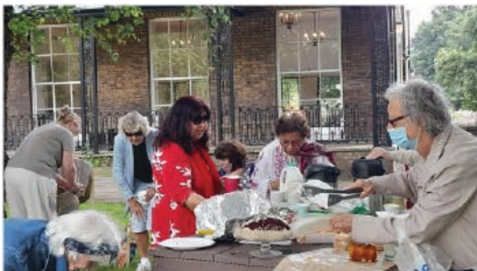
Post Covid = Tea and cakes drop-in at Millfield House

This will continue until December 2022 and by the time you reading this, we would have held a Health Day in partnership with Fusion in the middle of June 2022.