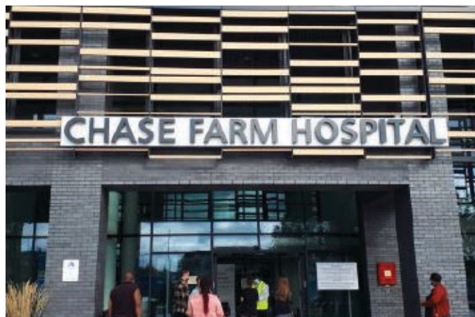
There is more focus than ever on the health service

The 111 service has become a significant adjunct to NHS services during the pandemic and, though it has worked well for some, it hasn't been an unqualified success, especially in times of crisis, and for a number of our older members has been an obstacle course. Your Forum is currently very concerned about plans to extend the current 111 arrangements, which cover the 5 North Central