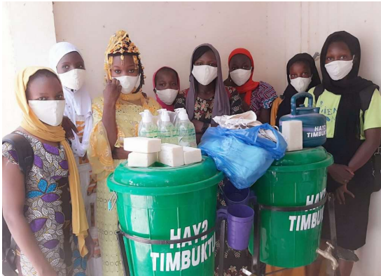
Covid-19 supplies provided through H2T

The last year has been a difficult one for everyone in Hay and Timbuktu. Trustees have been unable to meet face to face but, like others, have found Zoom a useful tool.