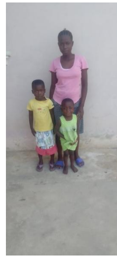
A new family helped in the community