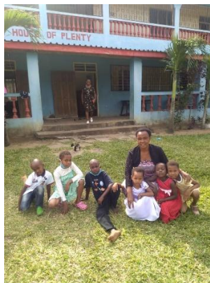
Children at MV on a relaxing Sunday