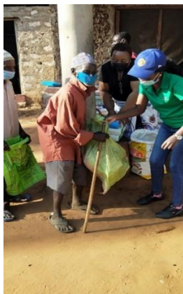
Feeding the villagers