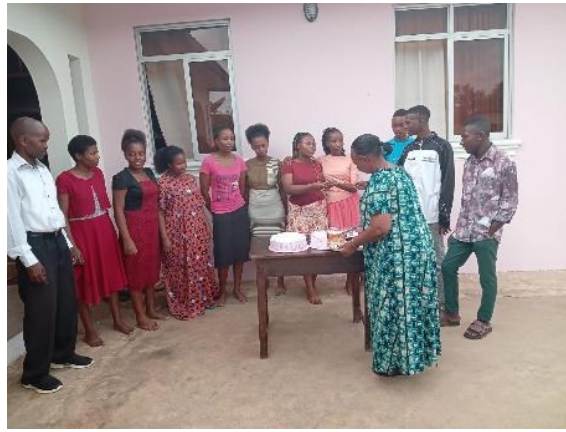
A celebration cake for Form 4 students