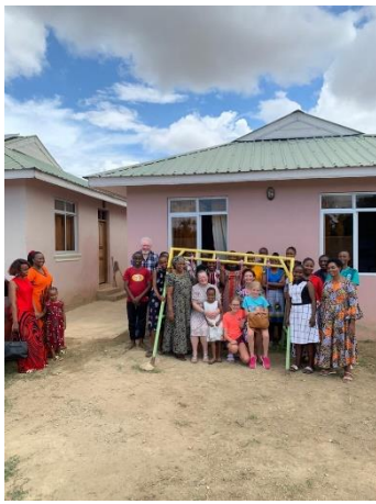
JHM children in front of their home