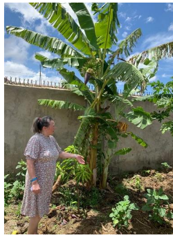
Trees and crops grown at JHM