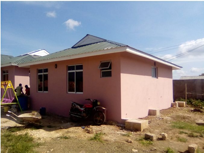
The additional two bedroom building for the boys at JHM.