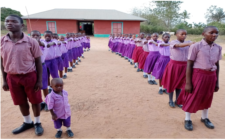
Children at the Gates of Joy in their