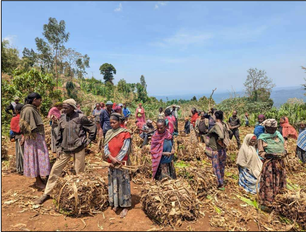
Distribution of false banana seedlings at Dande