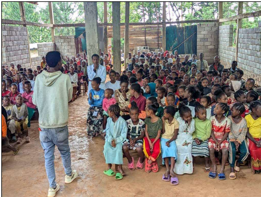
The end of year celebration at Lela Honcho school

All the schools had end of school year events to celebrate students' achievements. The students received their report cards and rewards.