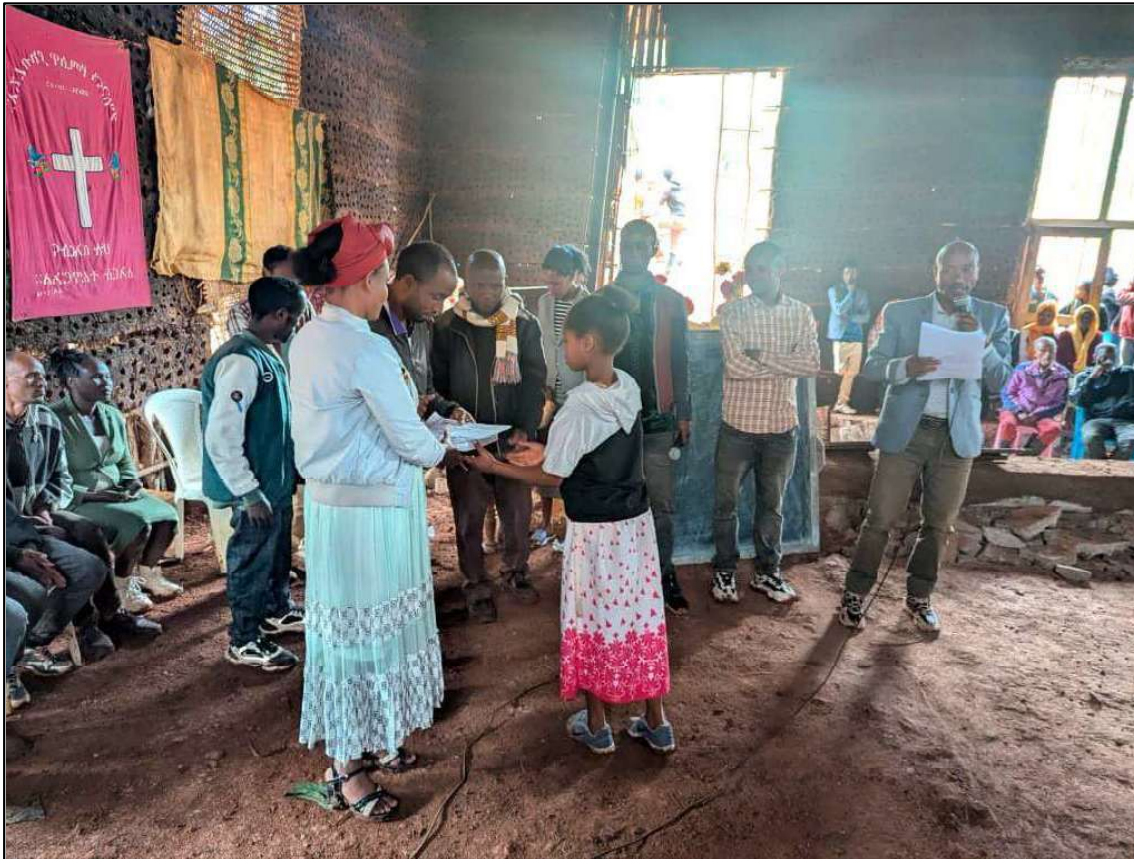
The awards being presented at Shigesho school