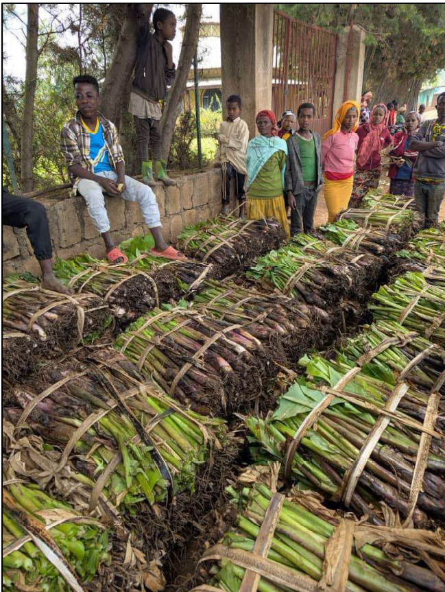
Seedling bundles ready for distribution at Banko Markos

This distribution took place over several days in the false banana season in April and May. The seedlings were transported to four different distribution points in the countryside to minimise to some degree the distance people would have to carry the heavy bundles home.