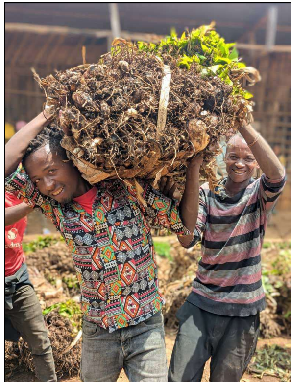
One of the OW coordinators