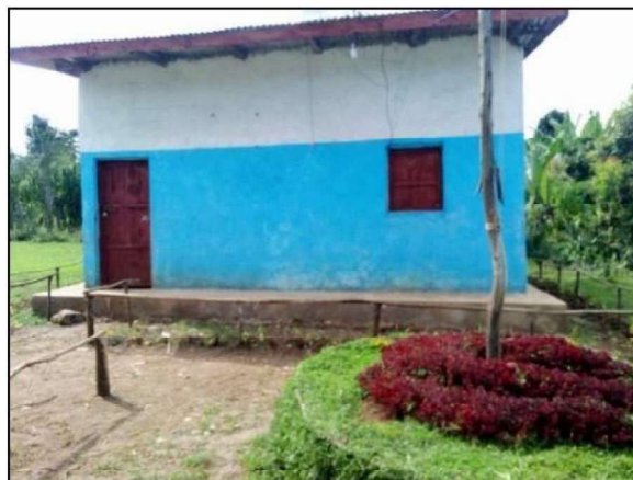
The library at Babe Colmocha