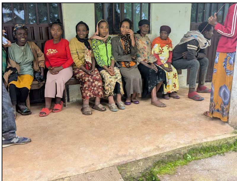
Some of the patients waiting for treatment and training