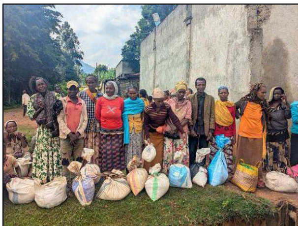
Grain beneficiaries at some of the collections