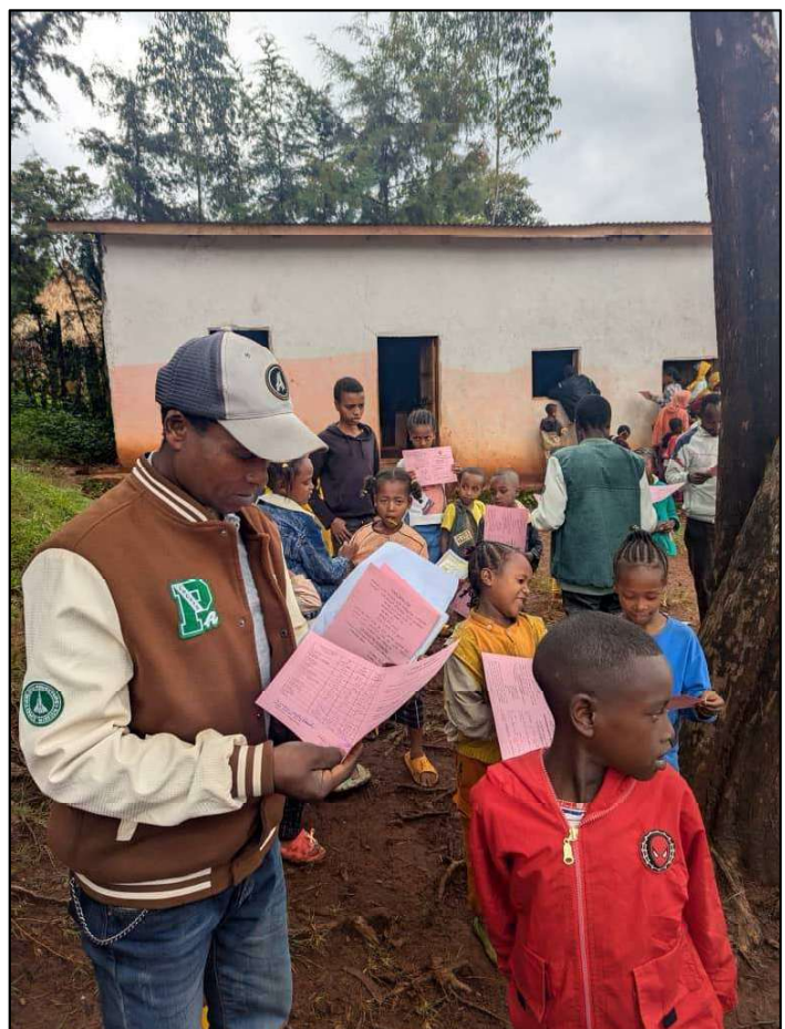
Students receiving their end-of-year report cards at Shigesho school