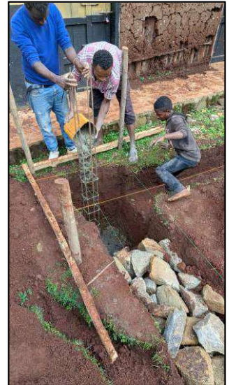
The new training hall under construction