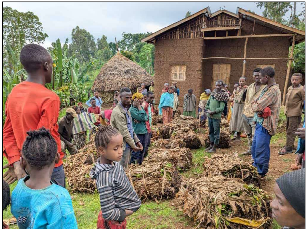
More distribution of seedlings at T-K