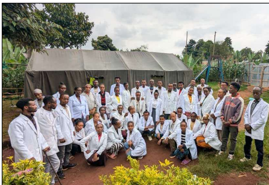
The Open Way teachers and librarians of 2025

At the heart of the educational work are the teachers and librarians from the community. As well as teaching, they support the wider effort. For example, their deep community knowledge makes them key to recognizing those families who need extra help.