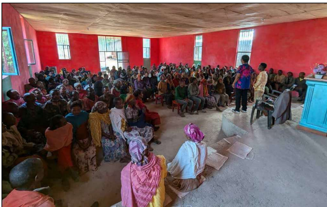
Trainees from Shoecho, Bentibata and Setamo assembled at one of the false banana training sessions in T-K

In total 2,250 people received training: all the false banana seedling beneficiaries as well as 650 people who received two 45-day-old chicks to rear from the OW farm. One of the sessions in the training included a session either on the practicalities of chick rearing, or the cultivation and management of false banana seedlings.