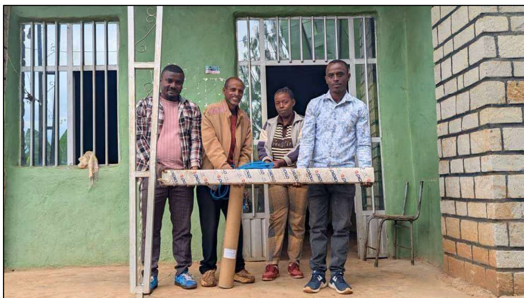
The T-K water authority receiving the pump

The pump is not yet installed but we are hoping this will occur soon.