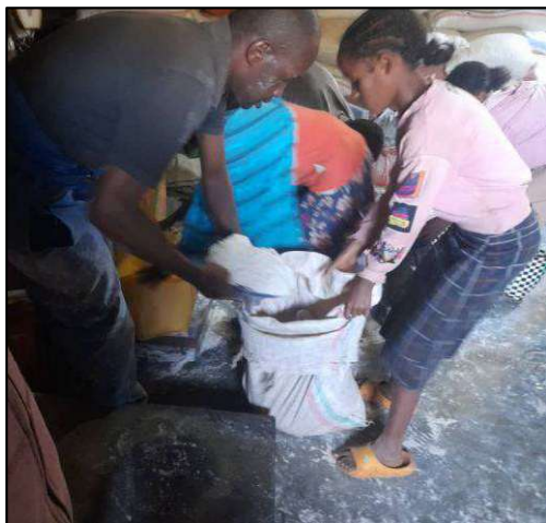
Maize flour being measured out at the mill

Grain is a crucial lifeline for many vulnerable families. The families are referred to Open Way via teachers at the schools and by medical staff at local clinics and hospitals where patients are taken for medical help. Beneficiaries collect the grain directly from the mill. This year about 300 families per month have received 15 kg rations of grain/flour.