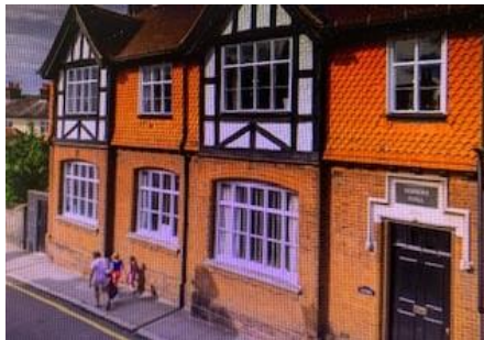
Somers Hall, Slipshoe Street