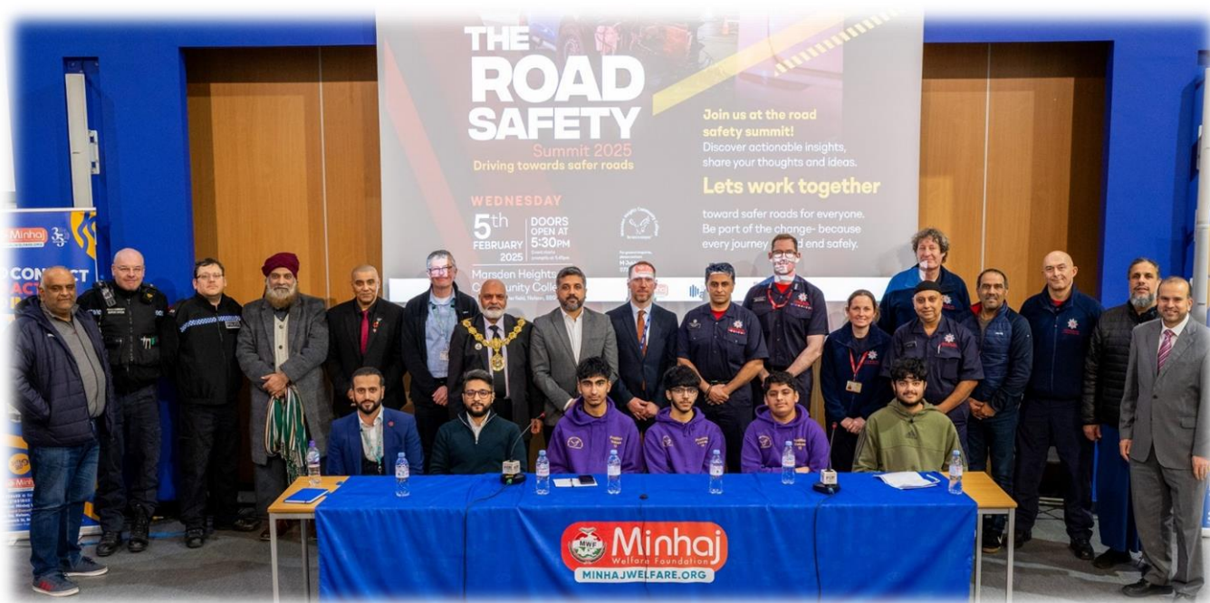
Photo above shows key stakeholders representing Lancashire Constabulary, Lancashire County Council, Lancashire Fire and Rescue Service, local councillors and religious leaders.