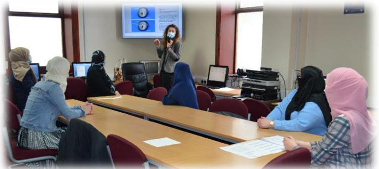
Participants are viewing a presentation at the start of a session on 'How to use Keyboard & Mouse'.

Whilst the Covid-19 pandemic and subsequent national lockdowns have not been welcomed, the participants have all attended regularly when safe to do so. They have really enjoyed participating in the course and learning new skills which will be beneficial to them in the future.