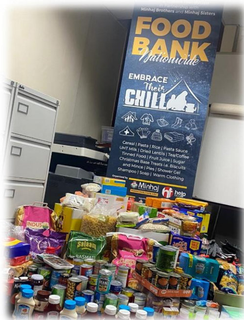
Photo above shows some of the items donated to the 'Embrace Their Chill' Food Bank. These items were then organised by MWF volunteers and distributed throughout East Lancashire to individuals and families in need.

The response received was amazing. The community of Pendle & East Lancashire got behind the campaign and donated in their thousands. Items such as cereal, pasta, rice, flour, sugar, tinned food and clothing was donated to help those struggling during the ongoing pandemic.