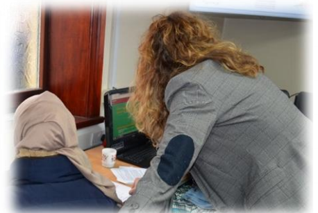
Photos above show participants completing practical tasks using the computers.