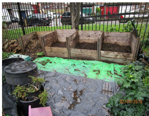
John Evelyn Garden - cutting chard leaves and composting units. Giant Sunflower and Gladiola.