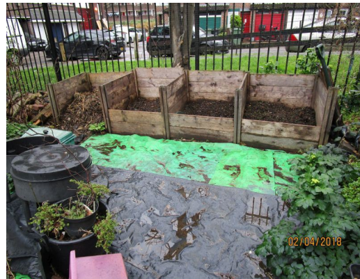
John Evelyn Garden - cutting chard leaves and composting units. Giant Sunflower and Gladiola.