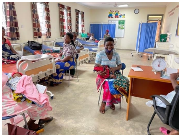
Busy Postnatal Ward