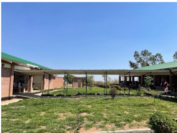
Maternity clinic (left) links to Primary health clinic

In November 2021, Khumbize Chiponda, Honourable Minister of Health, visited the facility and expressed her admiration for our health centre, the new maternity unit and the mentorship programme.