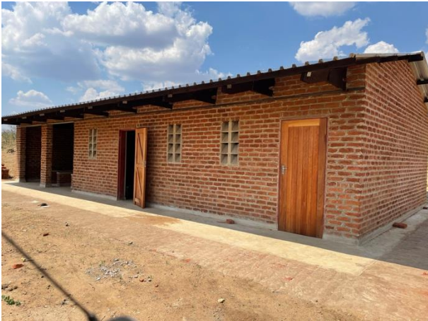
Exterior of new Guardian Shelter