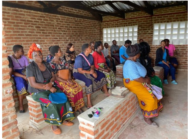
Using the shelter for a community meeting