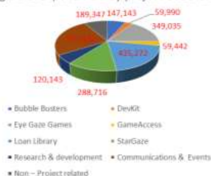
Figure 2: Expenditure by project 2021-2022

Charitable Activities comprise 83% of our work, which reflects the emphasis of our efforts on supporting the people we help. Figure 2 shows the allocation of expenditure for the financial year.