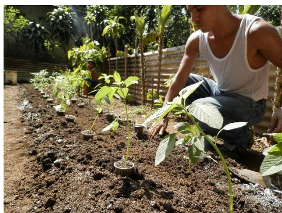
One of the kitchen gardens team prepares plants for a HIV family's garden