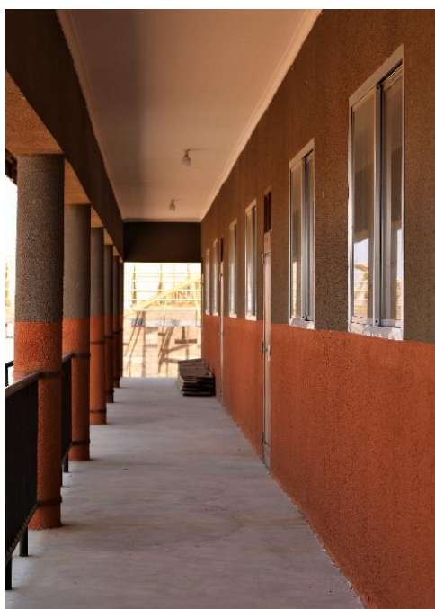
A view of the corridor outside one of the classrooms. A disabled access ramp has been provided

A concert and silent auction were held in November 2023 at the university to raise funds to furnish the new dormitories at Kisaki. This raised over £6,000. One of the government conditions placed on the school prior to its opening was for proper accommodation to be available for all pupils. The school opened on January 6 th 2024. Since SHOCC's first donation of £3,250 in 2015 to help fund the purchase of the land for the school, SHOCC has donated £131,264. This has paid for a tube well, classrooms, toilets, dormitories and the science laboratory roofs. This is one of the few girls boarding schools in the area and will take most of its intake from the Sisters of the Assumption primary school at Iguguno some 20 miles to the north-west. SHOCC hopes to be able to continue to support Kisaki for many years to come and SHOCC trustees will attend the official opening, hoped to be held in 2024.