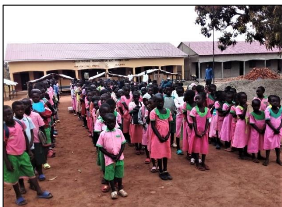
Pupils parade at assembly in front of their new classrooms

has been donated to upgrade the school. Pupil numbers have increased, absenteeism has declined and pupils no longer have to stay at home during the rains. The previous thatched classrooms leaked and it was impossible to hold lessons. Some of the funding was used to add classrooms to the primary school. The parish of Effingham and Great Bookham kindly provided £10,000 to furnish the classrooms and they have committed to providing a women's refuge and fees for orphans studying at the school. This project will start in 2024.