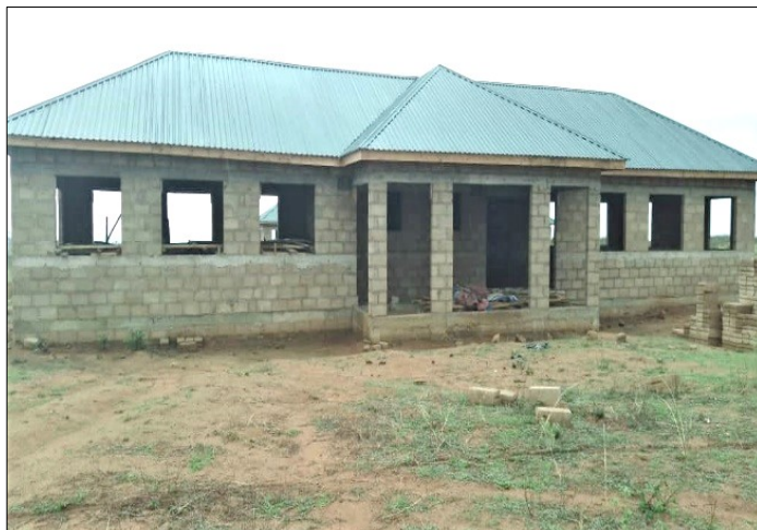
The roofed laboratories in December 2021. Since then, the walls have been plastered and doors and windows have