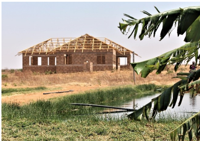
The science laboratories without their roof in June 2022. One of the three fish ponds at the school can be seen in the