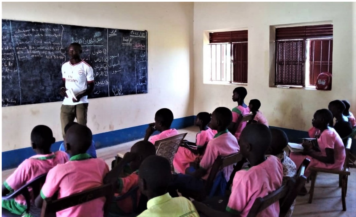
Children in their new classroom at Christ the King School Tambura-Yambio, South Sudan

Annual Report of the Trustees For the year ending 31st December 2022 Charity Registration Number 1120787