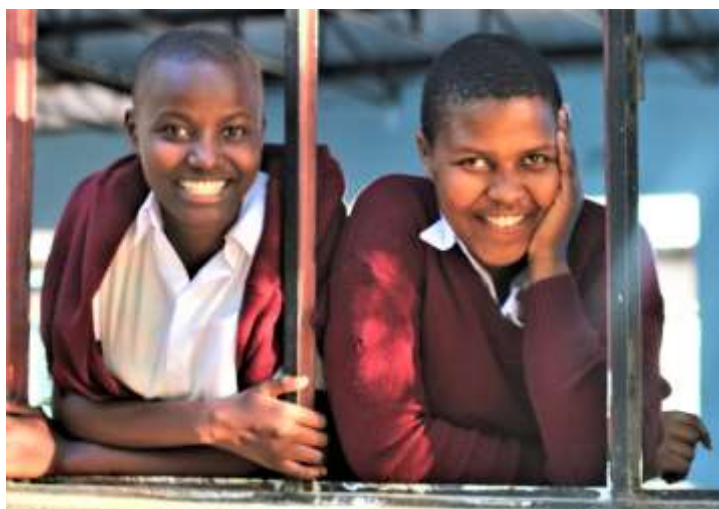
Two Orkilili pupils relax during a break in classes

SHOCC continued to support Orkilili during 2021 and provided funding to help the school during the Covid pandemic. With pupils unable to attend classes, the payment of school fees ceased and when conditions improved allowing pupils to return, face masks, sanitisers and other protective equipment had to be provided. The school continued to face challenges and pupil numbers have not recovered following the pandemic. Many pupils were forced to obtain work to help their families survive and several girls married or became pregnant and left school. A new future is