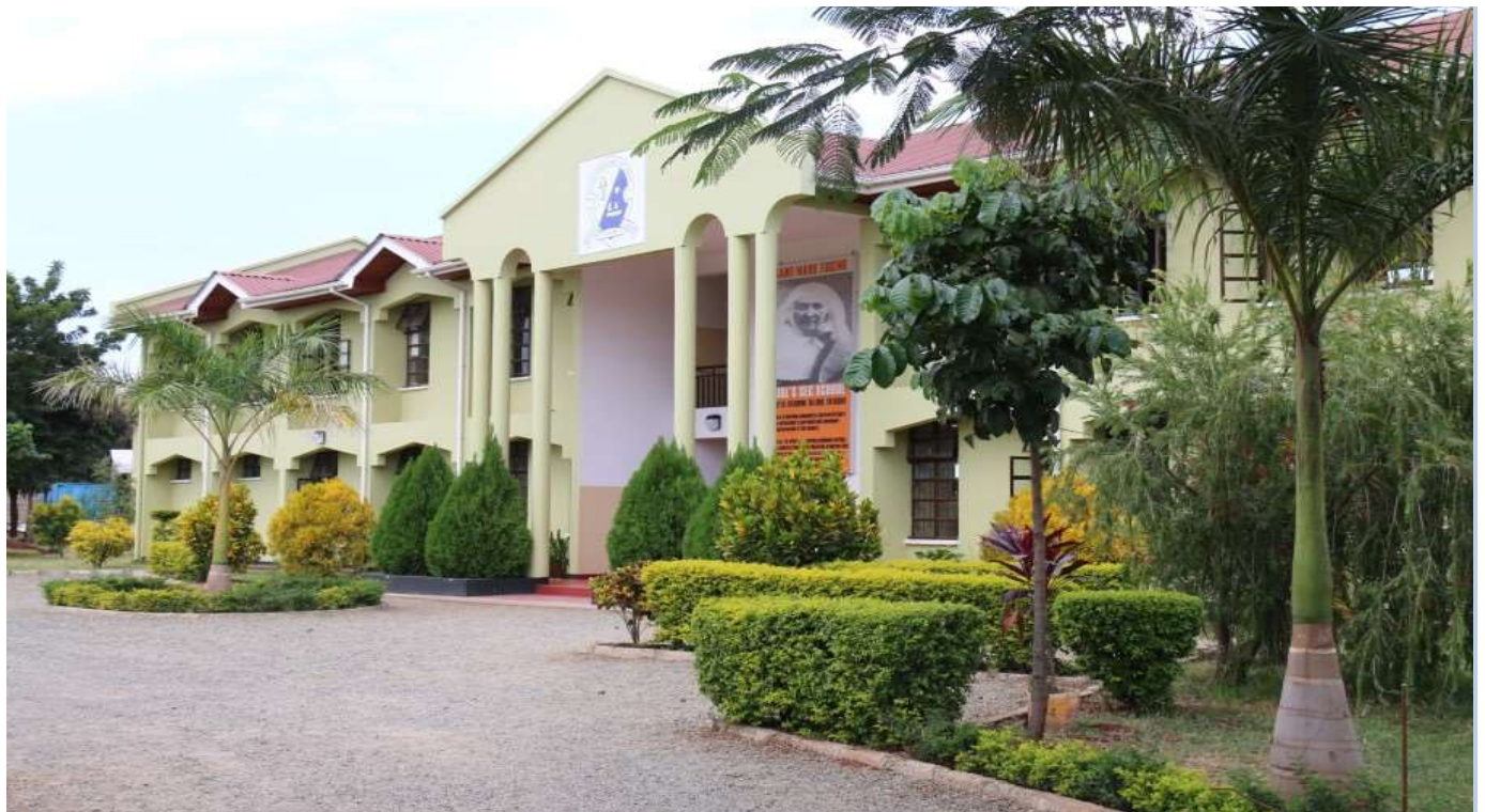
St. Marie Eugenie Girls' Secondary School near Moshi, Tanzania