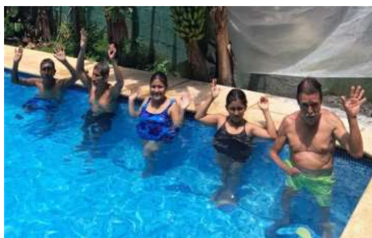
HIV patients enjoying their exercises in the new hospice hydro-therapy pool