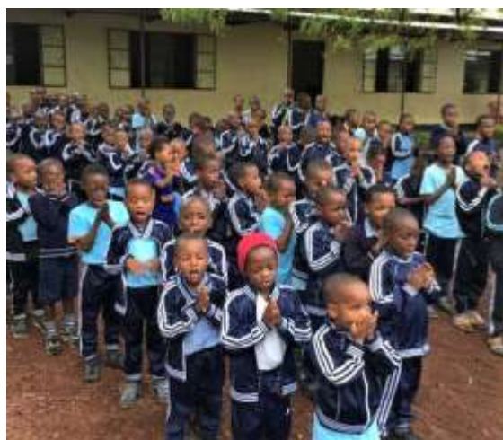
St Jude Thaddeus pupils at morning assembly in front of their classrooms