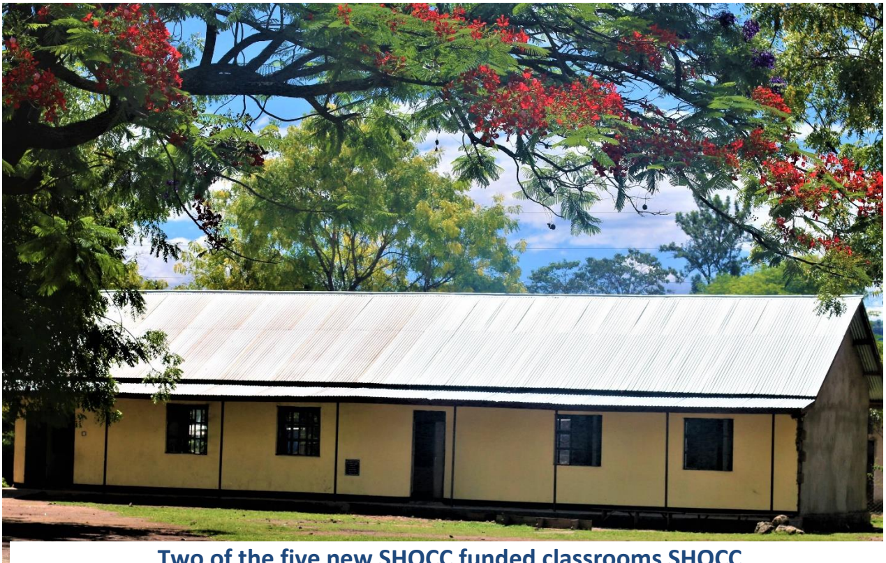
Two of the five new SHOCC funded classrooms SHOCC at St Jude's Primary school, Mto Wa Mbu, Tanzania