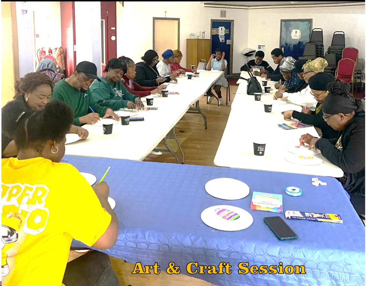
Art & Craft Session