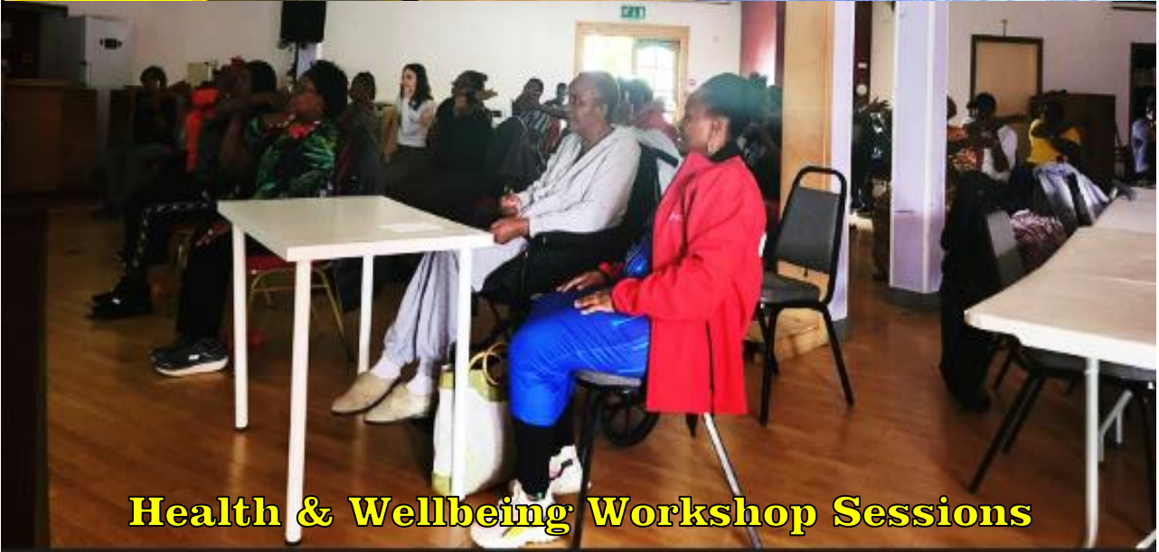
Health & Wellbeing Workshop Sessions