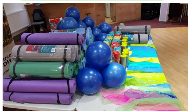
Some of our Older People's PILOT Fitness Activities During COVID-19 Restrictions