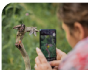
MOTH IDENTIFICATION EVENTS