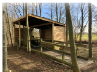
ACCESS AND INFRASTRUCTURE IMPROVEMENTS