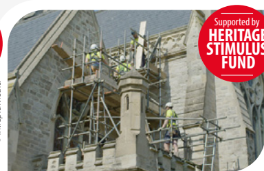
Newport Minster, Newport, Isle of Wight

In 2022 we made or recommended 258 grants (including those issued on behalf of others) worth a total of £1,961,578 for work including urgent roof repairs, installing modern community facilities and helping churches to plan for the future.