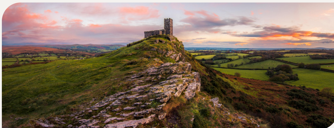
Sunset Panorama, Brentor Church, Dartmoor