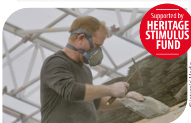
Friends Meeting House, Kendal

One of our key projects in 2022 was ensuring the completion of work at 32 churches and meeting houses in England which we had supported in 2021 with £3.6 million of funding for urgent repairs from the DCMS's Heritage Stimulus Fund. We were able to provide additional funds of £217,101 to nine of the projects in 2022.