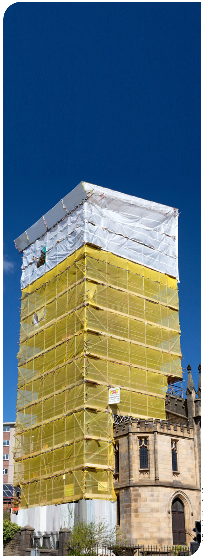
Tower repairs at Christ Church, Sowerby Bridge, West Yorkshire