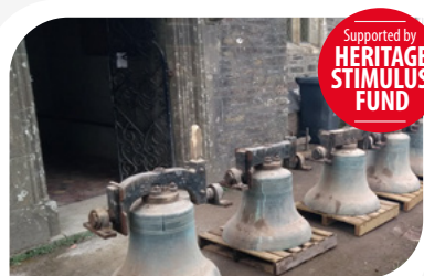
St Lawrence Church, Bigbury, Devon