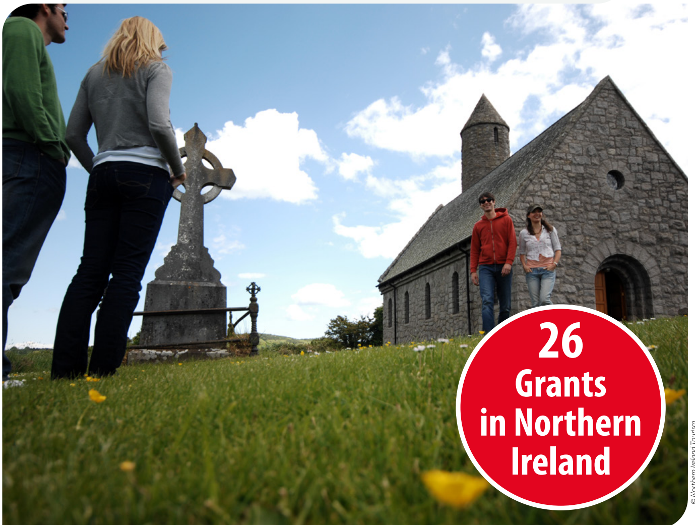
Saul Church, Downpatrick

Our grateful thanks go to the National Lottery Heritage Fund, the Pilgrim Trust and the Department for Communities for their support of Treasure Ireland.