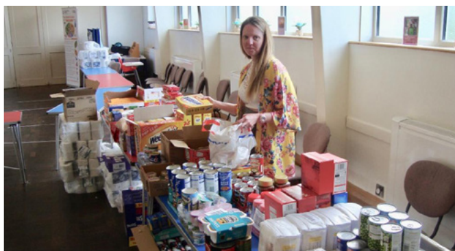
Food bank at Mount Merion Church.

In October a new training session was trialled for new grantee churches. This allowed attendees to find out about how we support churches including advice on fundraising, promoting churches to tourists and visitors and on using our MaintenanceBooker service. This training session will become a regular session in 2021.