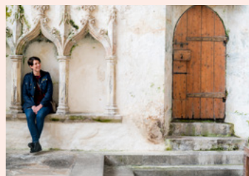
St Beuno's Church, Gwynedd, Wales

I also work with volunteers and clergy to encourage them to open their churches to visitors. I love delivering training, sharing good practice and seeing the positive benefits which come from opening the doors to churches and telling their stories imaginatively. Most recently, of course, the training has been delivered online; that has been a real success story with more people able to attend regardless of where they are based.