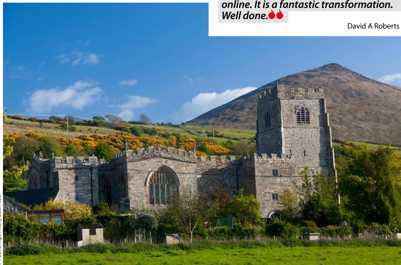
St Beuno's Church, Gwynedd, Wales, on the pilgrimage route to Bardsey Island.