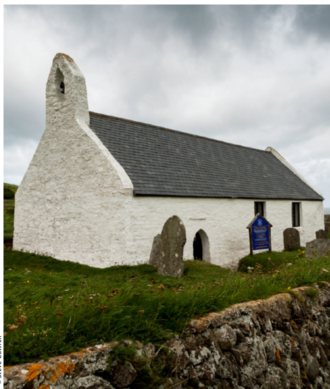
Church of the Holy Cross, Mwnt, Ceredigion, Wales

All our Wales content can be found in the visitor guide on ExploreChurches or at explorechurches.org/cymru .