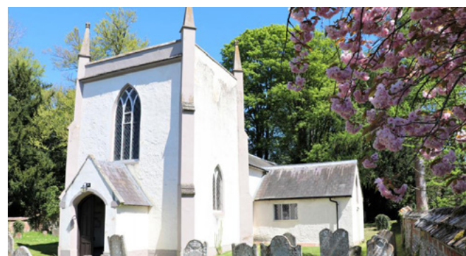
St Peter's church, Appleshaw

I have been a member, with my wife, for three years and it has been a very positive experience and that is because you and all around you are positive. The principal reason for writing is to support you entirely in your views that church buildings are most certainly not an irrelevance, quite the opposite.