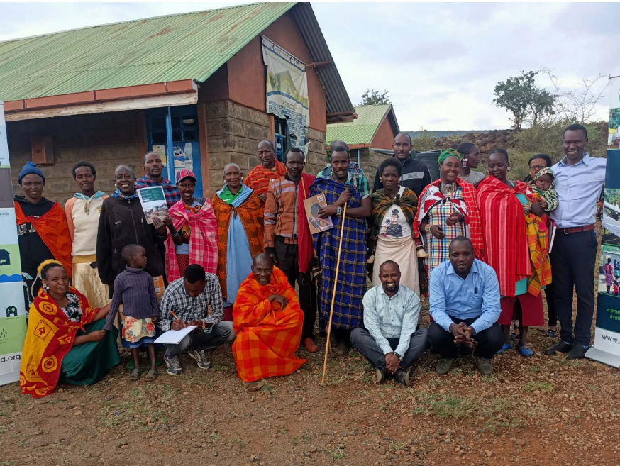
E4H inception meeting at the Ilkilorit Clinic, Kajiado County, Kenya. In Kajiado County, the proportion of patients accessing services at their dispensary, including refrigerated medications, and emergency services after dark, rose from 16% to 82%.

In rural Kenya and Nepal, health centres are under-resourced and, hampered by poor energy access, able to offer only basic healthcare. The energy gap means clinics can only operate in daylight and offer limited services, increasing risks for pregnant women and leading to higher rates of mortality from preventable and treatable disease. For the people who rely on these services the gap in health provision can be desperate.