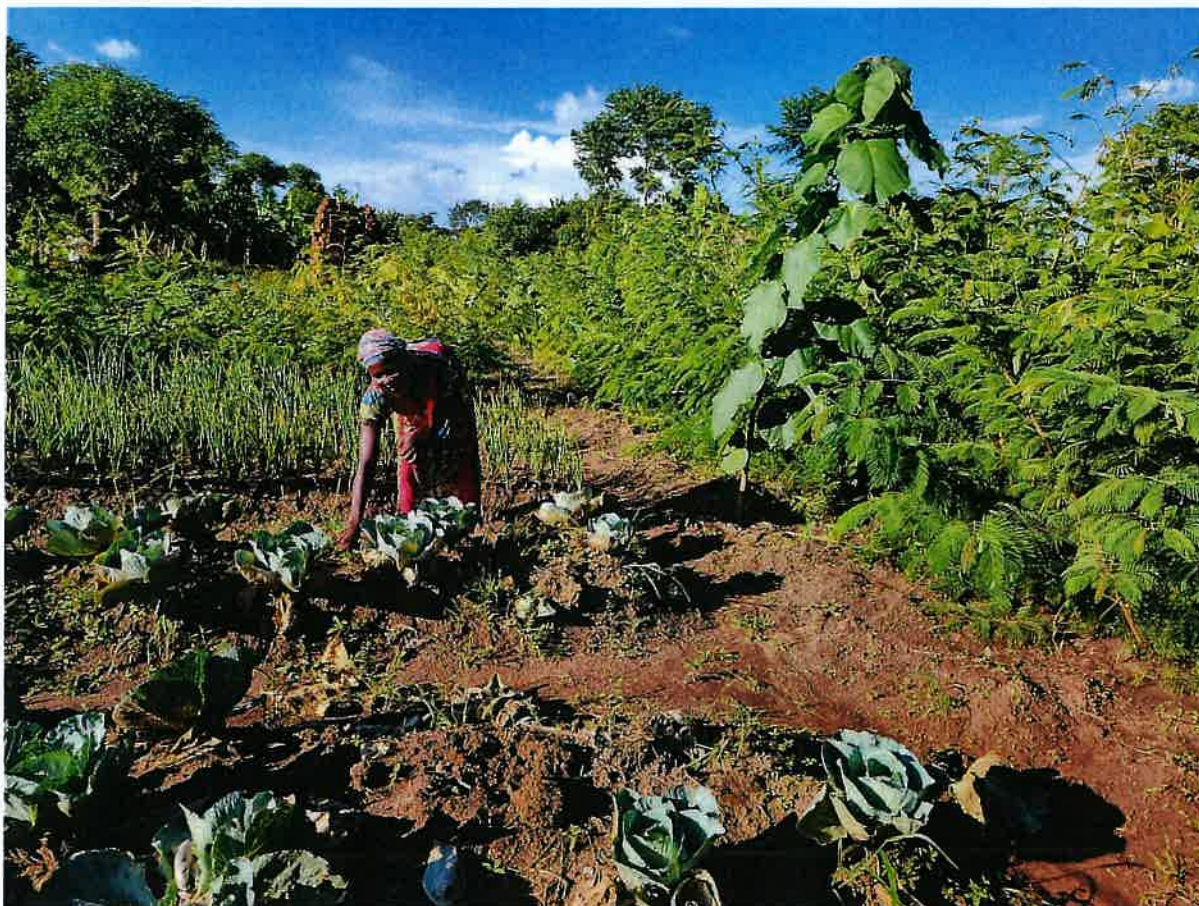
A Forest Garden

The tree planting programme was one of the programmes recommended by the external evaluator for roll out to all the districts where we are working. Given that Uganda lost 33% of its forests in the ten years to 2015, this is vital and we will begin the roll-out in 2024 in Gulu and Masindi. Other recommendations for improvement included: to offer financial literacy training, build capacity to link increased productivity to markets, improve energy efficient stove training and increase the focus on supporting people with disabilities. All these we will begin to attend to in 2024.