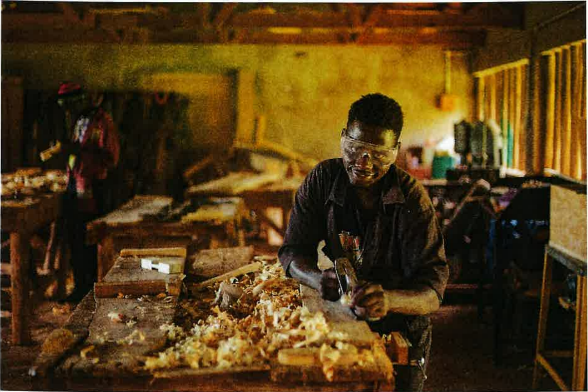
Kira trainee learning carpentry skills

Our family sponsorship programme with 503 children and caregivers achieved good results so that the most vulnerable can move to fully providing for themselves. Children's performance (those among the top 10 students in a class has risen from 37% to 52%), aided by their receiving school lunches, has inspired parents of children outside the programme to support their children better. The programme also distributed the sanitary pads made by the Kira trainees to the girls sponsored so that they would be able to continue education when their periods occur. Since our sponsorship programme focuses on transformation for the whole family, caregivers received conservation farming and business skills training, thus benefiting the household. Many families reported an increase in harmonious household relationships.