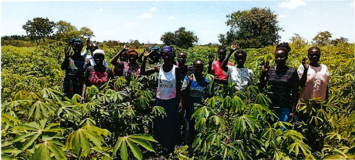
One community delighted with the outcome of the conservation farming training

This programme utilises a holistic approach, including conflict resolution training to foster a community spirit and growth mindset training so participants are able to make the best use of surplus harvest sales for developing businesses for the good of the family. Consequently, domestic violence in the first year has dropped from 77% to 7% and the number of women involved in decision making in the home has risen from 21% to 91%. As one man said, "Previously, the village grappled with frequent conflicts, particularly due to land disputes. However, with the introduction of mindset training, conflict resolution sessions, and ongoing mentorship, the community has undergone a complete transformation. Now, instead of conflict, peace prevails. People come together in unity, praying alongside each other, and offering support in times of need, showcasing the deep impact of collective efforts in fostering harmony and mutual assistance within the community."