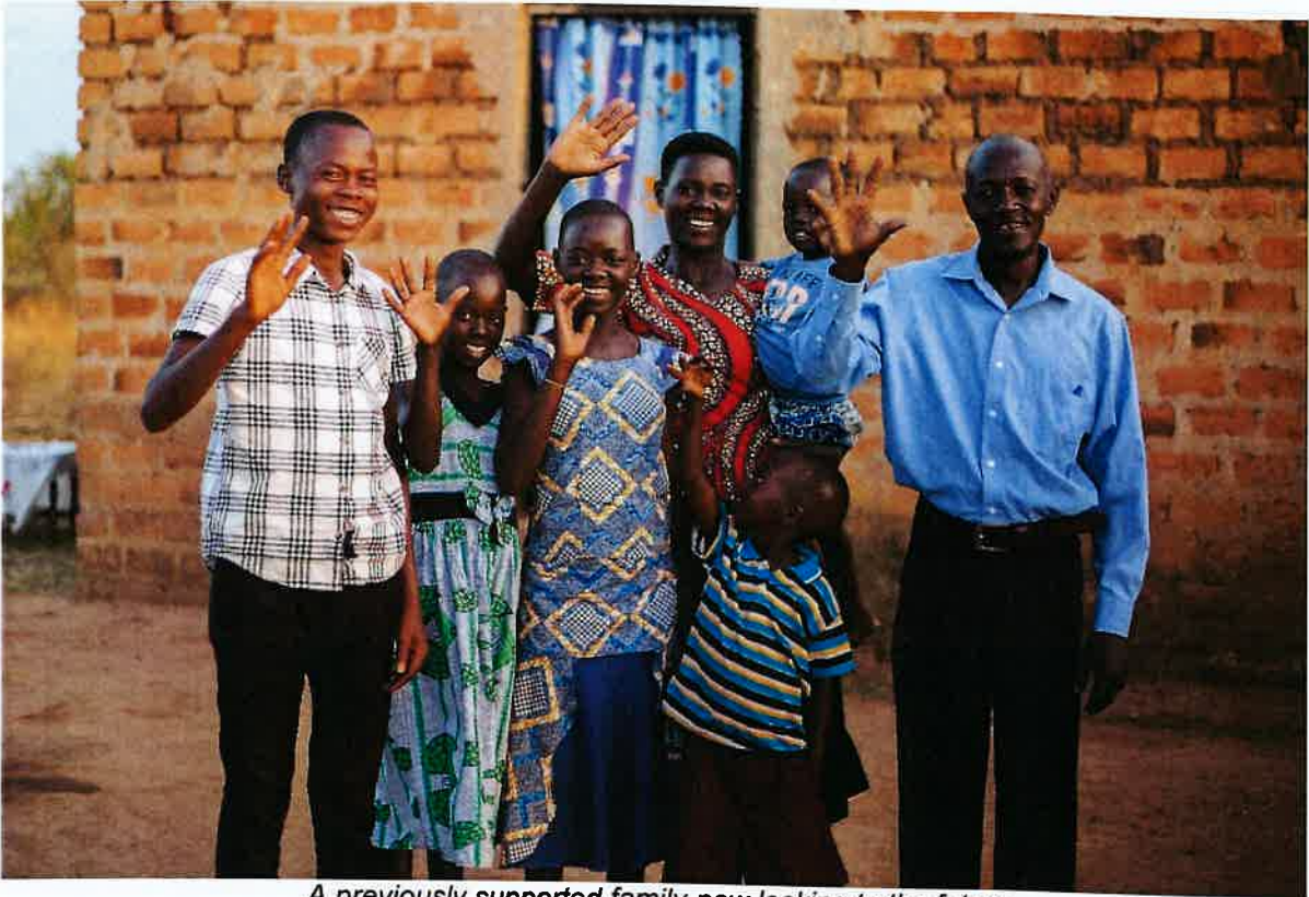
A previously supported family now looking to the future

Finally, in 2023 we commissioned an external and independent evaluation of our work and we are delighted that the evaluator from Makerere University concluded, "Amigos demonstrates excellent integrity and value for money in delivering its relevant, up-to-date and transformative programmes."