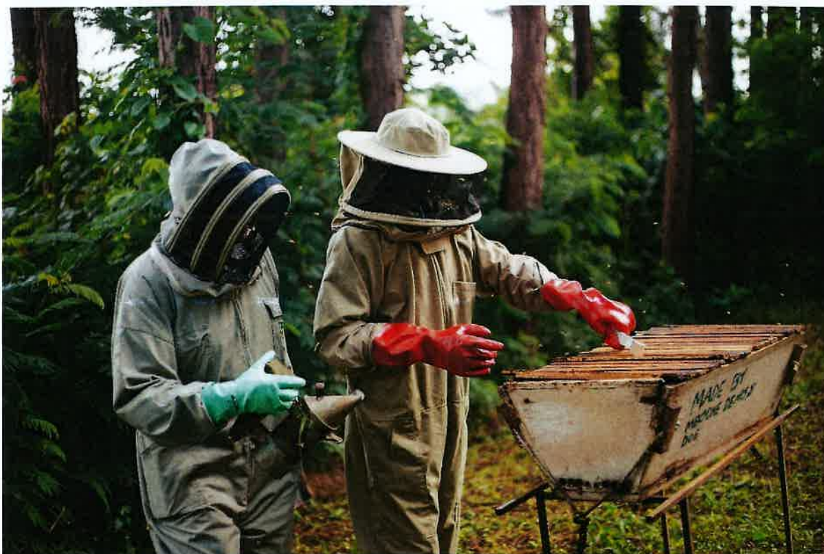
Kira trainees practising their beekeeping skills

The class of 2023 Kira Farm trainees graduated in November 2023. This year two new courses were added, electrical wiring and beekeeping. The former is in response to the increased electrification in rural Ugandan communities. The latter, in partnership with Bees Abroad, aims to see a growing number of successful beekeeping groups developing honey businesses supported by Kira graduates.