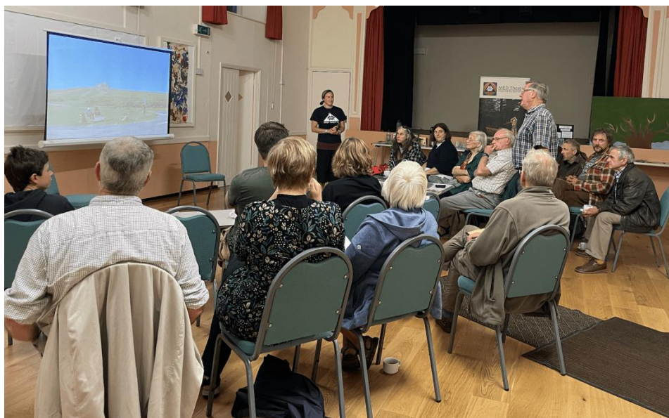
Initial community meeting