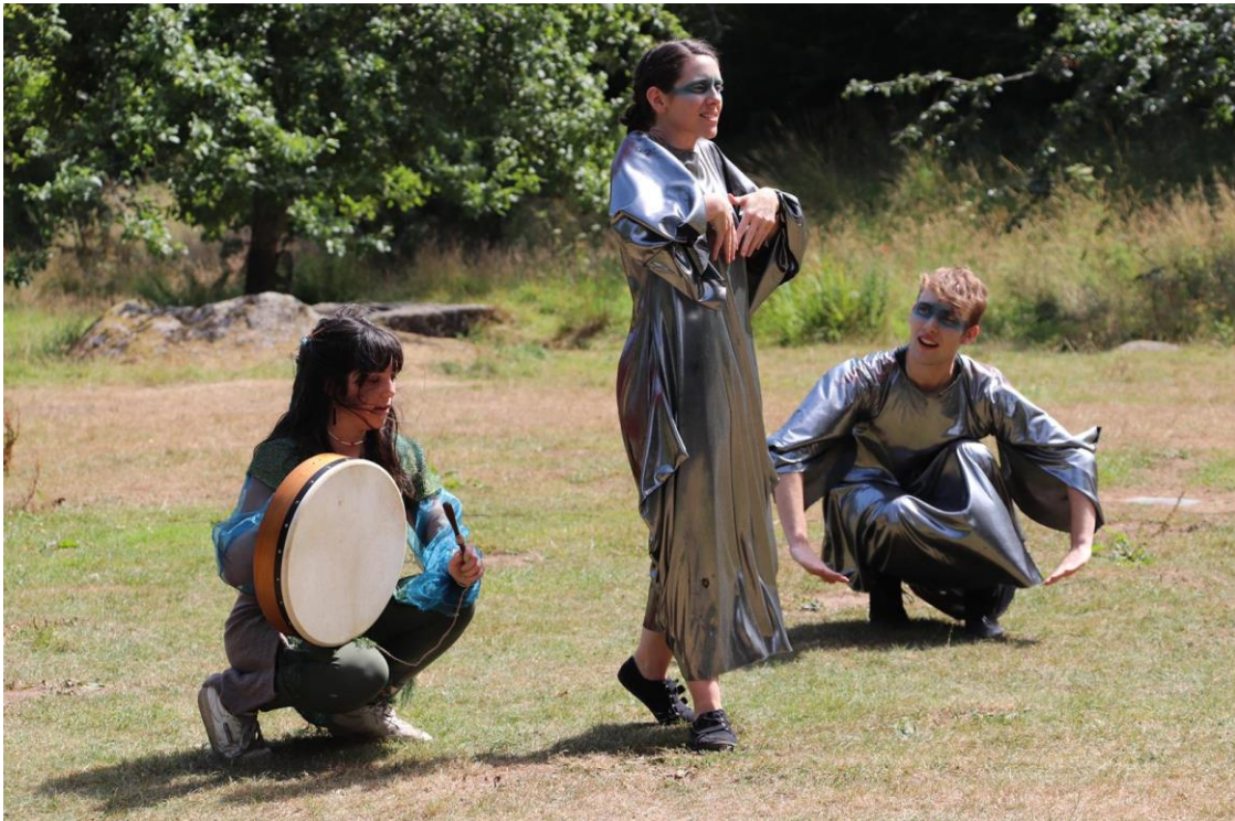
LEAP performance in Lustleigh Orchard