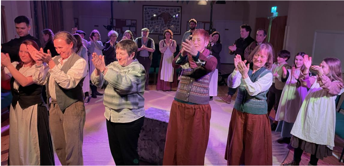
Cast of Granite