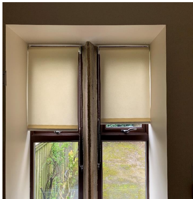
Blind replacement in Meeting Room.