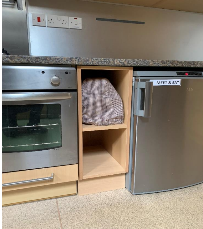
New shelving unit fitted to kitchen, kindly made by D Pollard.