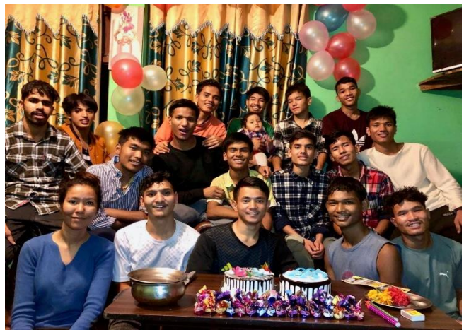
Farewell party at VFN

The nine boys aged over 18 and at college and university moved to a smaller flat in August. They are more mature, growing up fast and doing well.