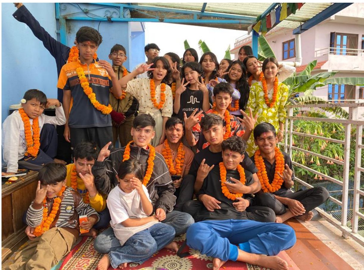
Children at the New Nepal Society Centre