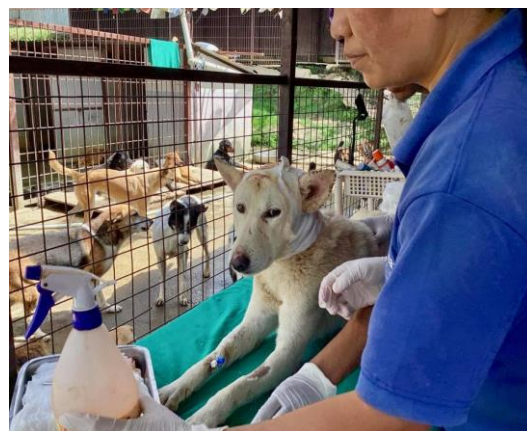
Sete being treated for a maggot infection

We have supported their vaccination programme for the past 5 years with 1200 anti-rabies vaccinations given during March and April. Rabies still kills many people in Nepal. Sneha Shrestha, the founder, runs the Centre with the help of 19 staff and a few volunteers.