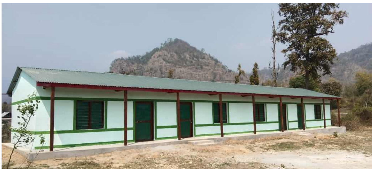
Shree Chokuney School, Surkhet