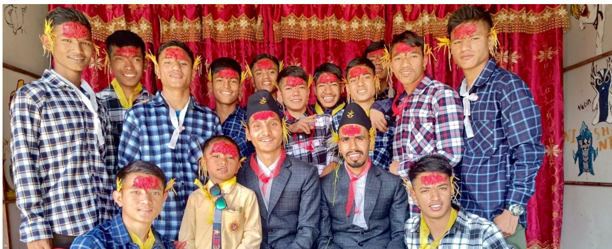
The VFN family