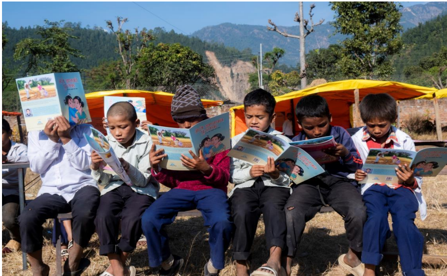
Magic Read Programme MHN