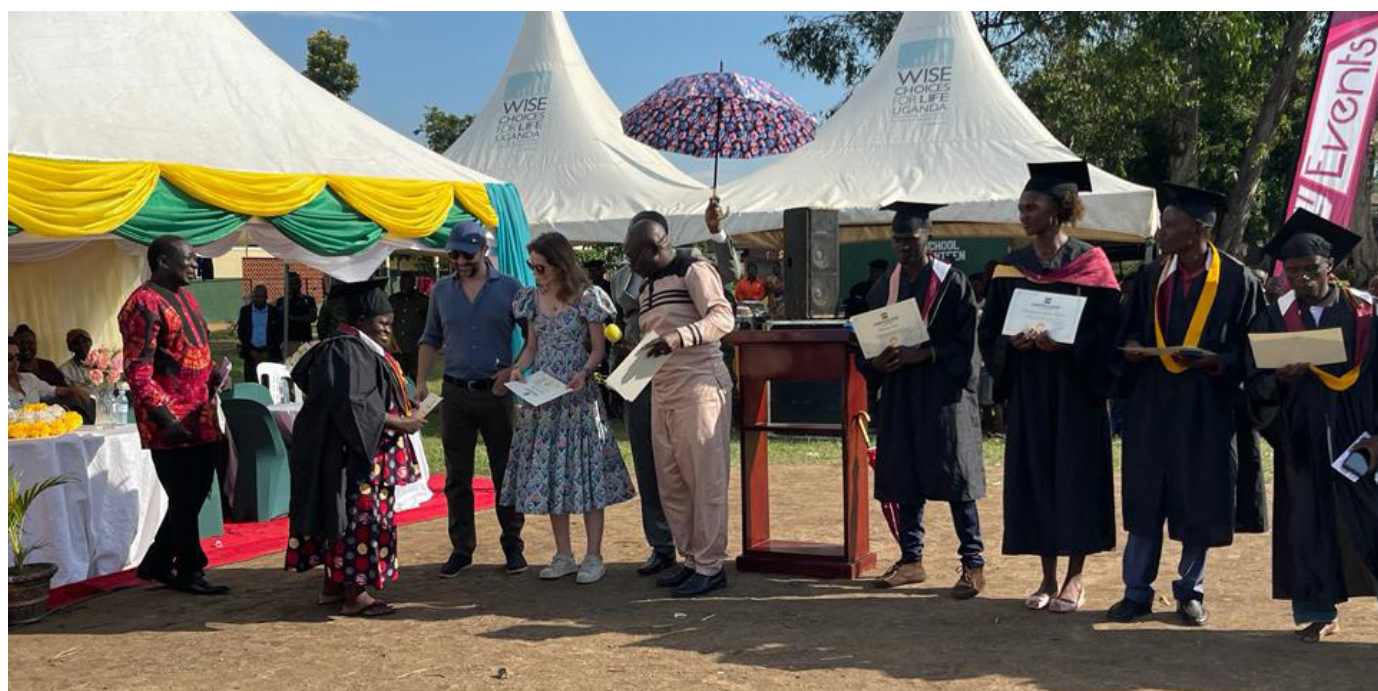
Graduation ceremony for our first ICT graduates from our new IT Centre.