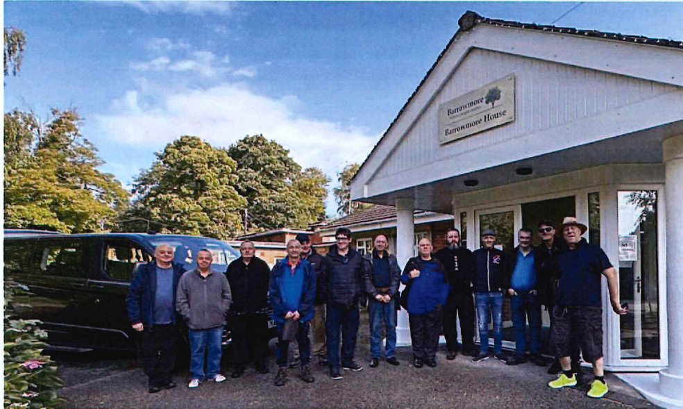
Barrowmore residents and staff