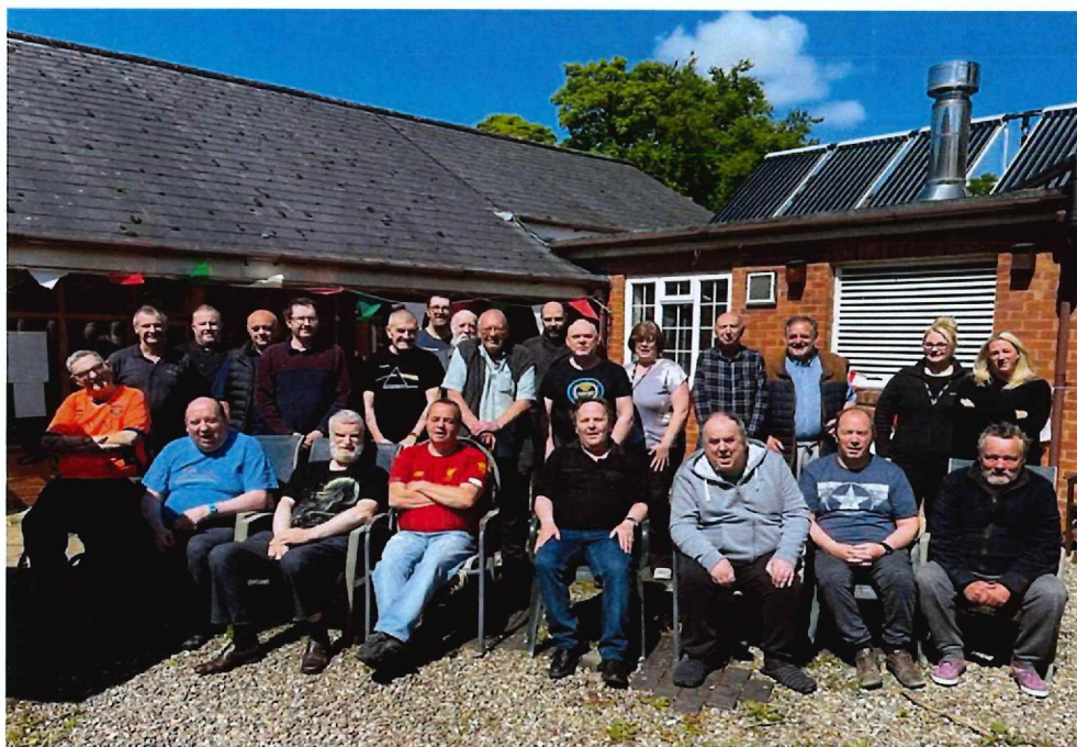
Barrowmore residents and staff