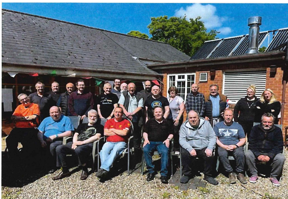
Barrowmore residents and staff