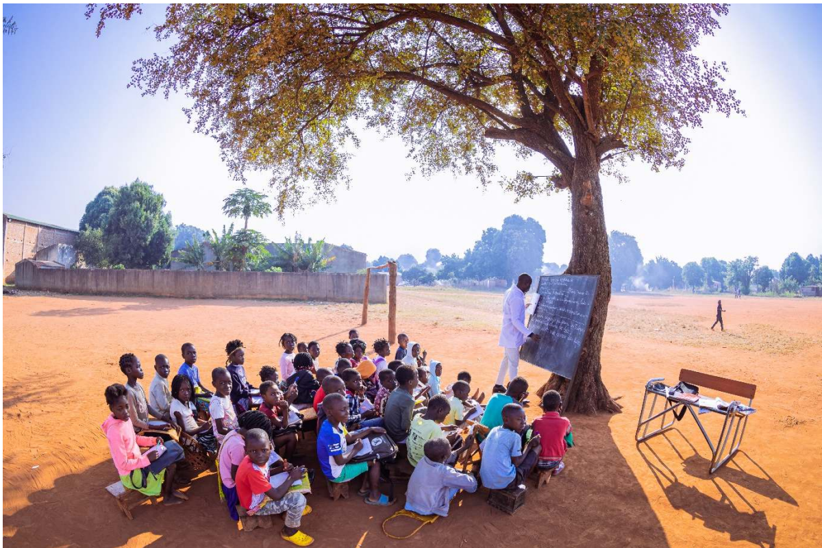
Children at Tsuanda School, Mozambique.