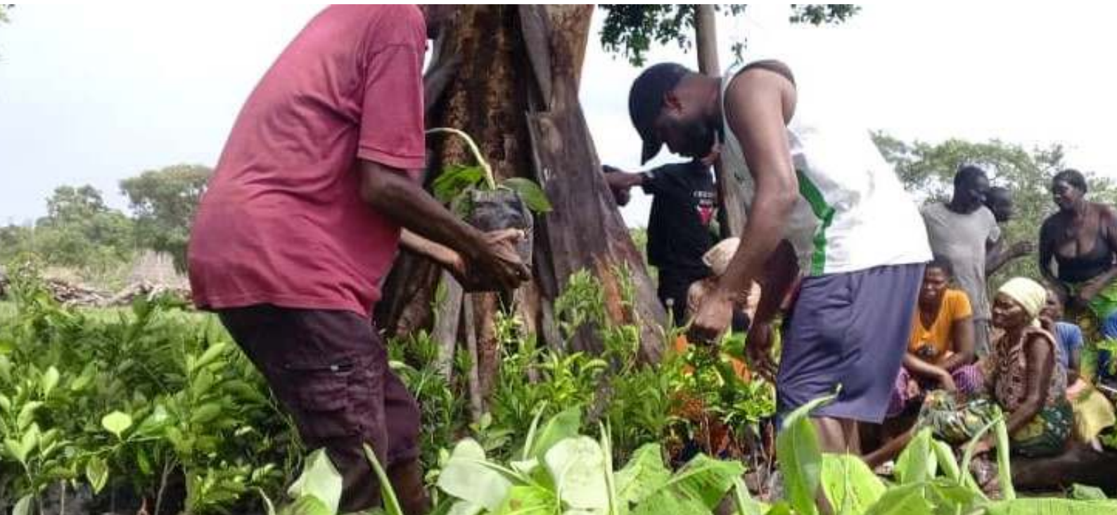
Integrated project at Imana Community in Zambia