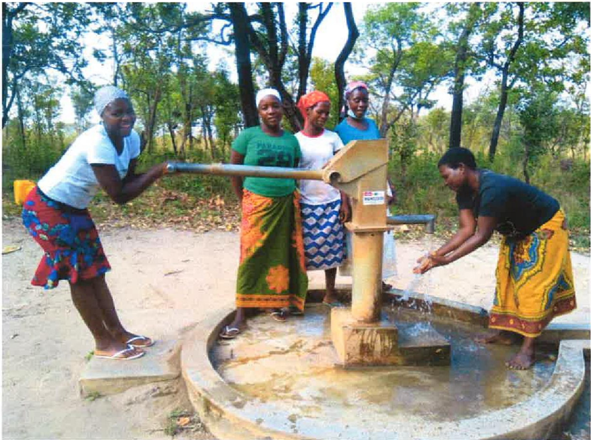
Women from Nhandiro Cruzamento, Mozambique, try out the water at their rehabilitated pump.

Registered charity numbers: 1117377 (England & Wales) and SCO44129 (Scotland) Company number: 05970344