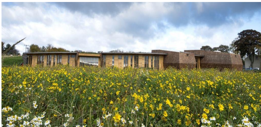
SUNBEAMS MUSIC CENTRE

All driven to “Reach the Unreachables” through the power of music to heal.