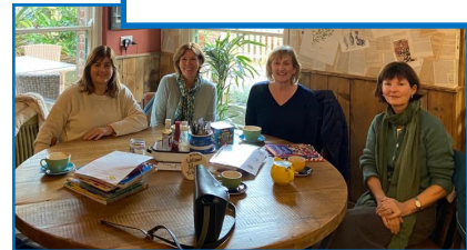
Library visit for volunteers