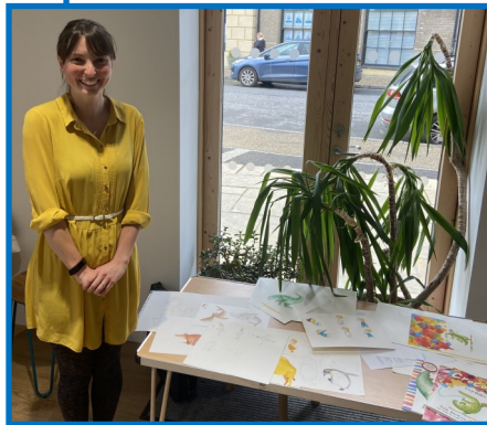
Guest speaker at our 2022 AGM