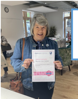
Completing The Open University Reading for Pleasure course