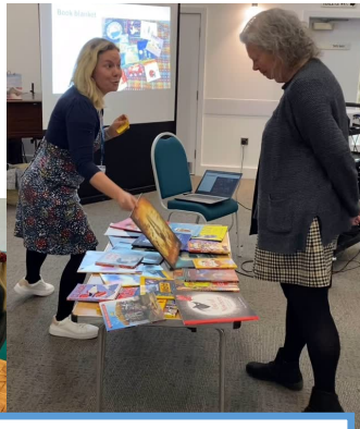
Ongoing training and workshops