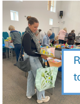
Regular Book Exchanges to replenish resources