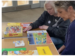
Initial Training to prepare volunteers for the reading partner role