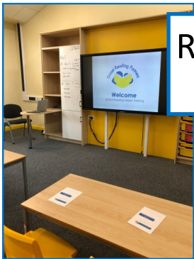
Reading Buddy training for our schools