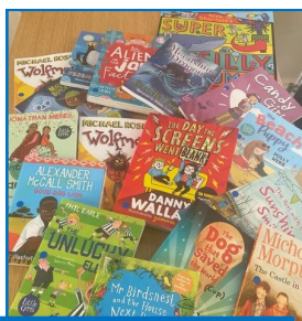
Lovely new resources thanks to The Delamere Foundation