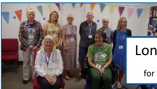
Long Service awards for our wonderful volunteers