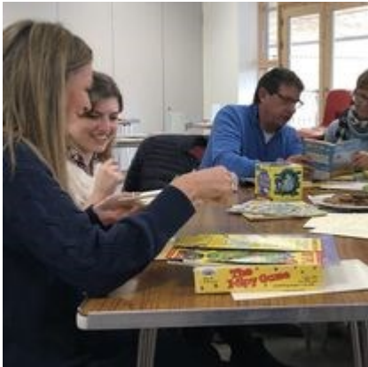
Initial training days For new recruits