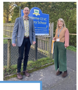
Celebrating a decade of volunteering!