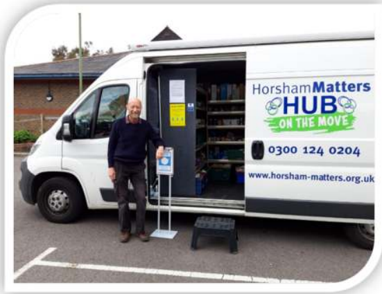
Our volunteer driver with the Hub on the Move

As Trussell Trust members we were asked to join their Pathfinders programme In December 2020. We have developed an action plan which supports innovation such as our supermarket foodbank and Hub on the Move whilst working with clients to improve foodbank experiences. Our goal and that of Trussell Trust's is to eradicate the need for foodbanks in society; getting to the root cause of client's financial challenges and therefore having a long term impact upon households not just addressing the food crisis itself.