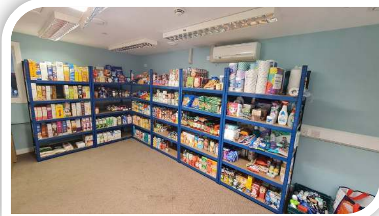
Supermarket Foodbank, Lavinia House

The supermarket model has proved to be the most popular foodbank with clients. Client A states that;